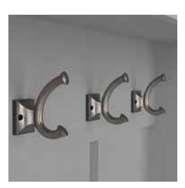
Double-prong coat hooks