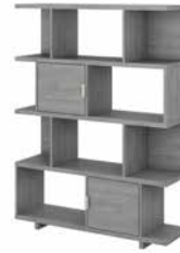
Large Etagere Bookcase with Doors