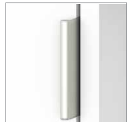
Brushed Satin Nickel hardware