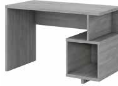
48W Single Pedestal Desk