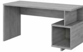
60W Single Pedestal Desk