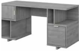
60W Double Pedestal Desk