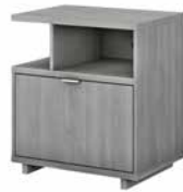
27W Lateral File