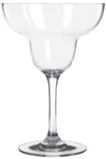
Margarita Item No. 6034967 Model No. 92414 11 oz./325 ml. H6¾ T4¾ B3½ D4¾ 1 doz./5# 1.34 cu. ft. SCC 555045