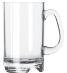
Mug Item No. 6034972 Model No. 92419 16 oz./473 ml. H5½ T3½ B3½ D4½ 1 doz./7# .71 cu. ft. SCC 555144