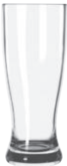
Pilsner Item No. 6034970 Model No. 92417 14 oz./414 ml. H7 T2½ B2½ D2½ 1 doz./6# .55 cu. ft. SCC 555014