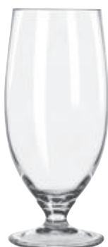
Goblet Item No. 6034974 Model No. 92423 18 oz./532 ml. H7¼ T2½ B3 D3¼ 1 doz./5# = .73 cu. ft. SCC 555137