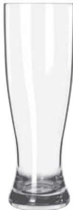
Pilsner Item No. 6034971 Model No. 92418 23 oz./680 ml. H9 T3¼ B2¾ D3¼ 1 doz./8# .88 cu. ft. SCC 555427