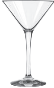
Martini Item No. 6034966 Model No. 92412 8 oz./237 ml. H7¾ T4¾ B3¼ D4¾ 1 doz./5# 1.4 cu. ft. SCC 555007