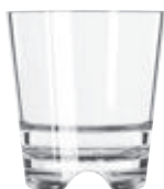
Stacking Rocks Item No. 6034959 Model No. 92402 8 oz./237 ml. H3 1 / 2 T3 1 / 8 B2 1 / 4 D3 1 / 8 1 doz./3# = .44 cu. ft. SCC 554918