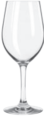
Wine Item No. 6034965 Model No. 92410 12 oz./355 ml. H7¾ T2½ B2½ D3½ 1 doz./4# .73 cu. ft. SCC 554987