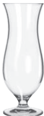
Hurricane Item No. 6034973 Model No. 92421 16 oz./473 ml. H7¼ T3 B3 D3 1 doz./4# = .66 cu. ft. SCC 555021