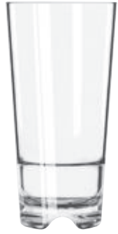
Stacking Cooler Item No. 6034964 Model No. 92408 20 oz./591 ml. H6¾ T3¾ B2½ D3¾ 1 doz./6# .78 cu. ft. SCC 555120