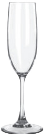
Flute Item No. 6034969 Model No. 92415 6.5 oz./192 ml. H9 T1½ B3 D3 1 doz./4# .74 cu. ft. SCC 554970