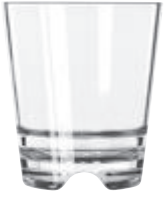
Stacking Double Old Fashioned Item No. 6034961 Model No. 92404 12 oz./355 ml. H4 T3½ B2½ D3½ 1 doz./5# .52 cu. ft. SCC 554932