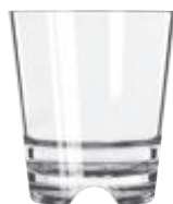
Stacking Rocks Item No. 6034960 Model No. 92403 10 oz./296 ml. H3 3 / 4 T3 3 / 8 B2 1 / 2 D3 3 / 8 1 doz./4# = .52 cu. ft. SCC 554925