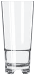
Stacking Beverage Item No. 6034962 Model No. 92405 12 oz./355 ml. H6 T2½ B2½ D2½ 1 doz./4# .59 cu. ft. SCC 554956