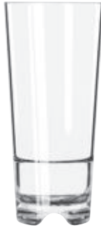
Stacking Cooler Item No. 6034963 Model No. 92407 16 oz./473 ml. H6¾ T3½ B2¼ D3½ 1 doz./5# .62 cu. ft. SCC 554963