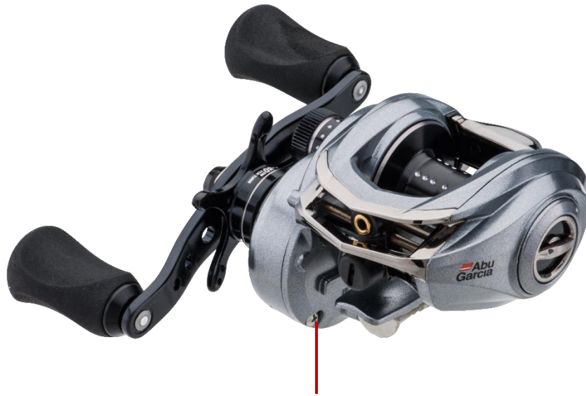
Maintenance Port Screw

As with any precision product, your Revo® reel will require regular maintenance. Gently rinse the reel with fresh water, wipe it dry and lubricate according to the accompanying diagram (picture of oil and grease points). Revo® Reels are equipped with a main gear access door called the Maintenance Port . This feature allows anglers to easily grease the main gear without taking the reel completely apart. To use this feature, locate the lube port screw pictured below.