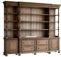
323-15-131 MEDIA WALL TOP CENTER DECK CAMEL

Grooved back panel, two removable shelves, one fixed wood framed glass shelf, two can lights, touch lighting. Must be sold as a complete wall system with 323-15-231 Bottom Center Base and 323-15-331 End Units.