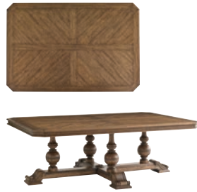
323-15-01 RECTANGULAR COCKTAIL TABLE CAMEL

Meranti solids with Meranti and Mappa burl. Finish: Caramel