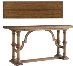
323-15-06 FLIPTOP CONSOLE TABLE CAMEL