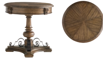
323-15-14 LAMP TABLE CAMEL

Hand-forged wrought iron scrolls on base. Assembly required.