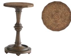
323-15-16 MARTINI TABLE CAMEL