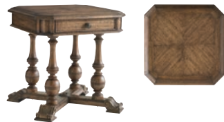
323-15-10 END TABLE CAMEL