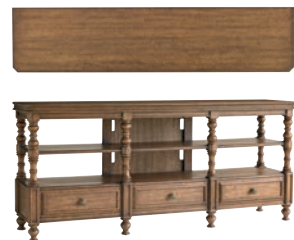
323-15-30 FREESTANDING MEDIA CONSOLE CAMEL

Three drawers, three fixed shelves, removable back panel in center, recessed electrical outlet.