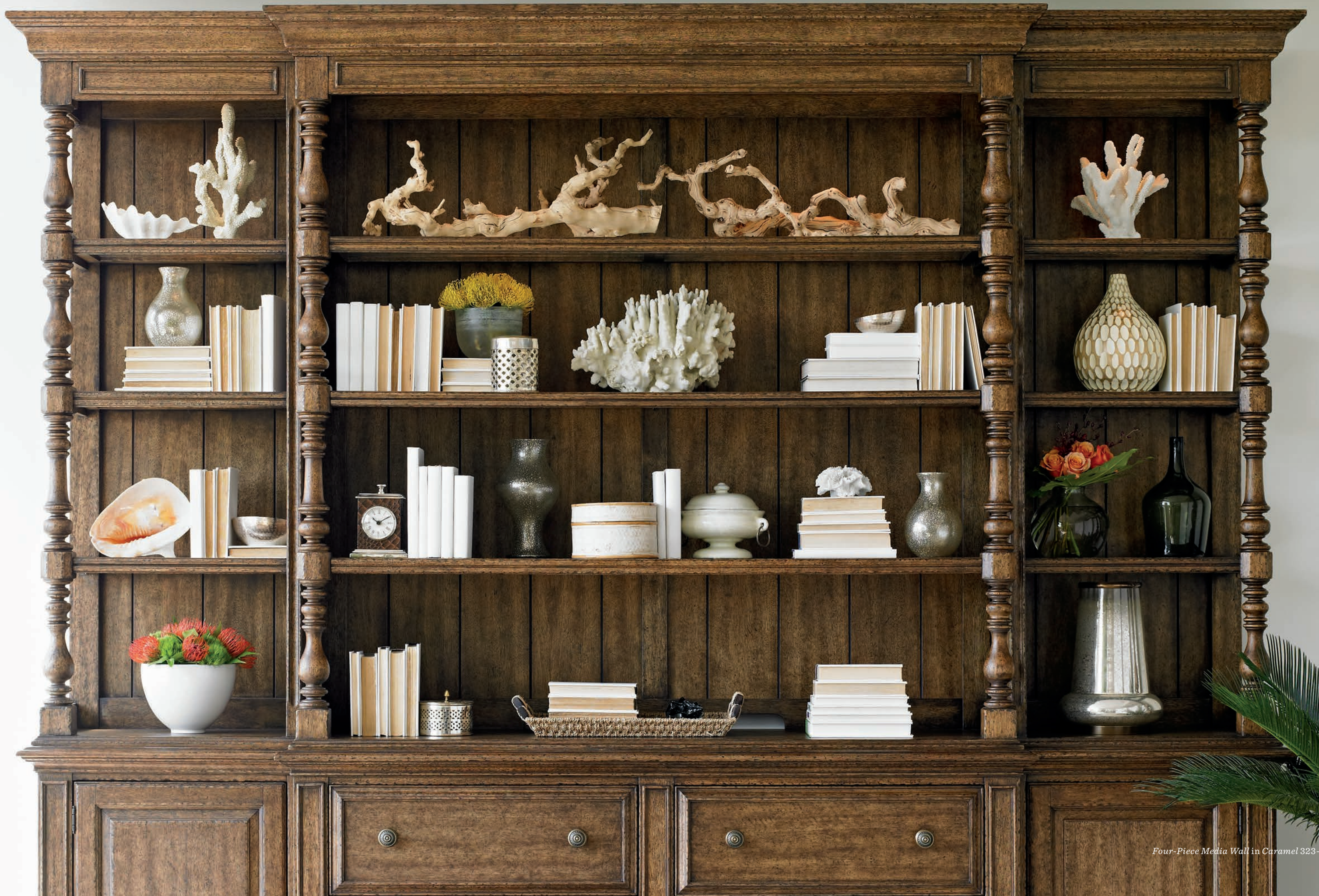
Four-Piece Media Wall in Caramel 323-15-31