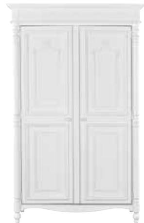
226-0018 ISABELLA ARMOIRE 44 5/8W 23 7/8D 72H (113 x 61 x 183 cm)