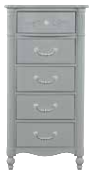
226-0011 ISABELLA SINGLE CHEST 23 13/16W 21 1/4D 46 7/8H (60 x 54 x 119 cm)