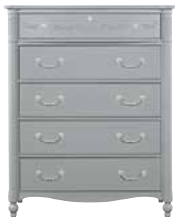
226-0012 ISABELLA CHEST 41 1/8W 21 1/4D 50 7/8H (104 x 54 x 129 cm)