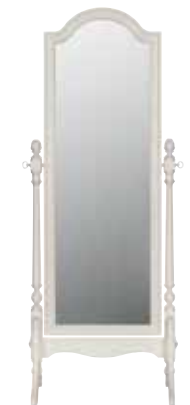
MIR-0033 CHEVAL DRESSING MIRROR Overall: 24 1/4W 20 5/8D 64H (62 x 52 x 163 cm)