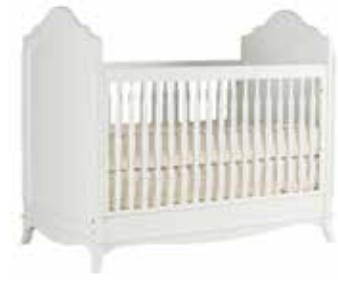
SSC-1300 GRACE CRIB Overall: 31 7/16W 47 1/2H 55 15/16L (80 x 121 x 142 cm)