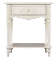
226-0081 ISABELLA NIGHT TABLE 23 5/16W 18 3/8D 26H (59 x 47 x 66 cm)