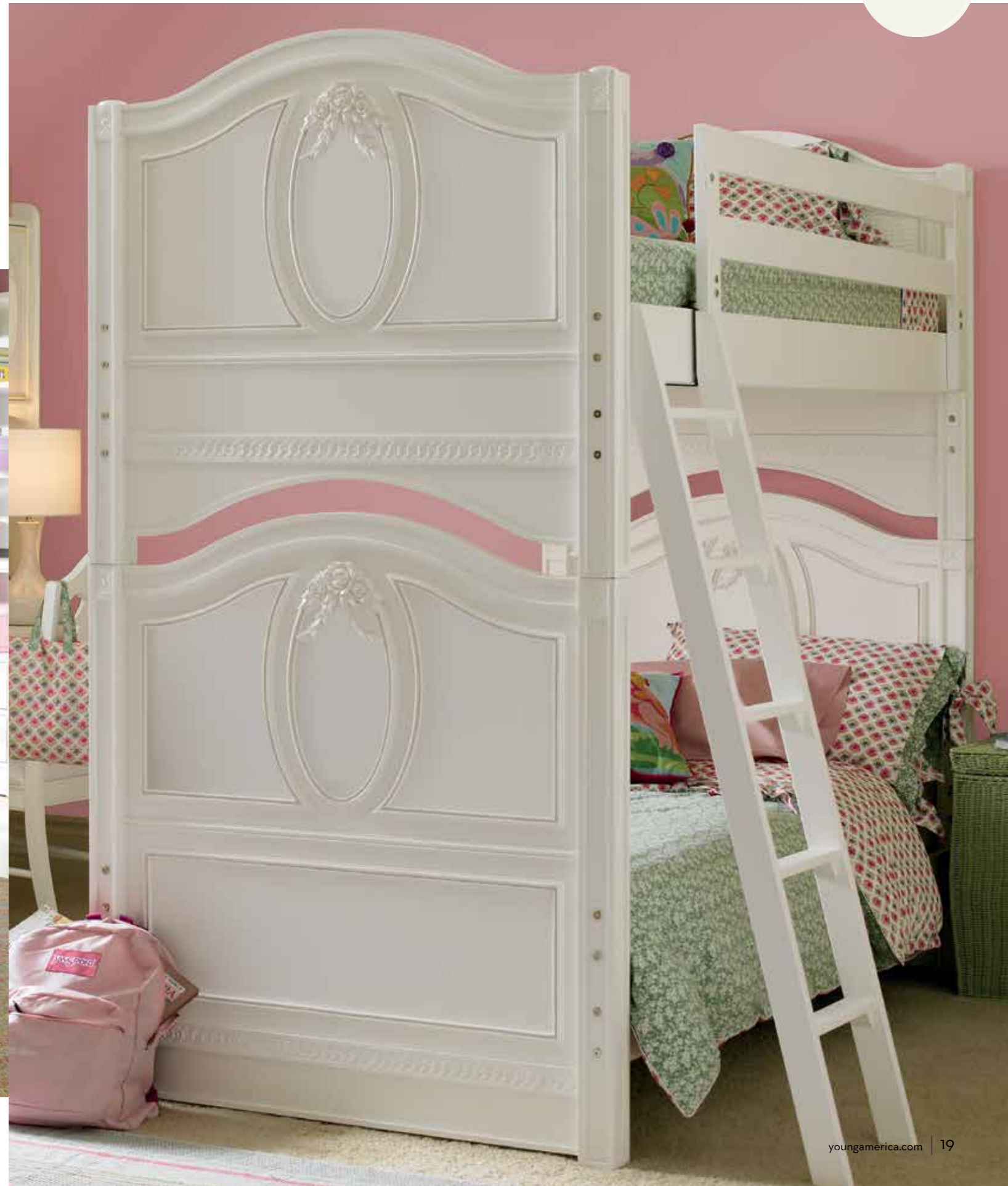
ISABELLA BUNKABLE BED, TWIN 226-7350-B1 STARLIGHT TRUNDLE BED STORAGE DRAWER TSU-0069-B1 STARLIGHT