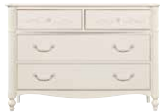
226-0001 ISABELLA SINGLE DRESSER 48W 21 1/4D 33 1/8H (122 x 54 x 84 cm)