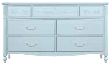
226-0002 ISABELLA DOUBLE DRESSER 58 7/16W 21 1/4D 33 1/8H (148 x 54 x 84 cm)