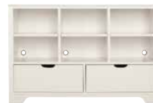
WAL-8195 DANA LARGE CONSOLE * 49 1/4W 19 1/8D 33H (125 x 49 x 84 cm)