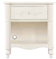
226-0080 ISABELLA 1 DRAWER NIGHT STAND 23 13/16W 18 3/8D 25 1/8H (60 x 47 x 64 cm)