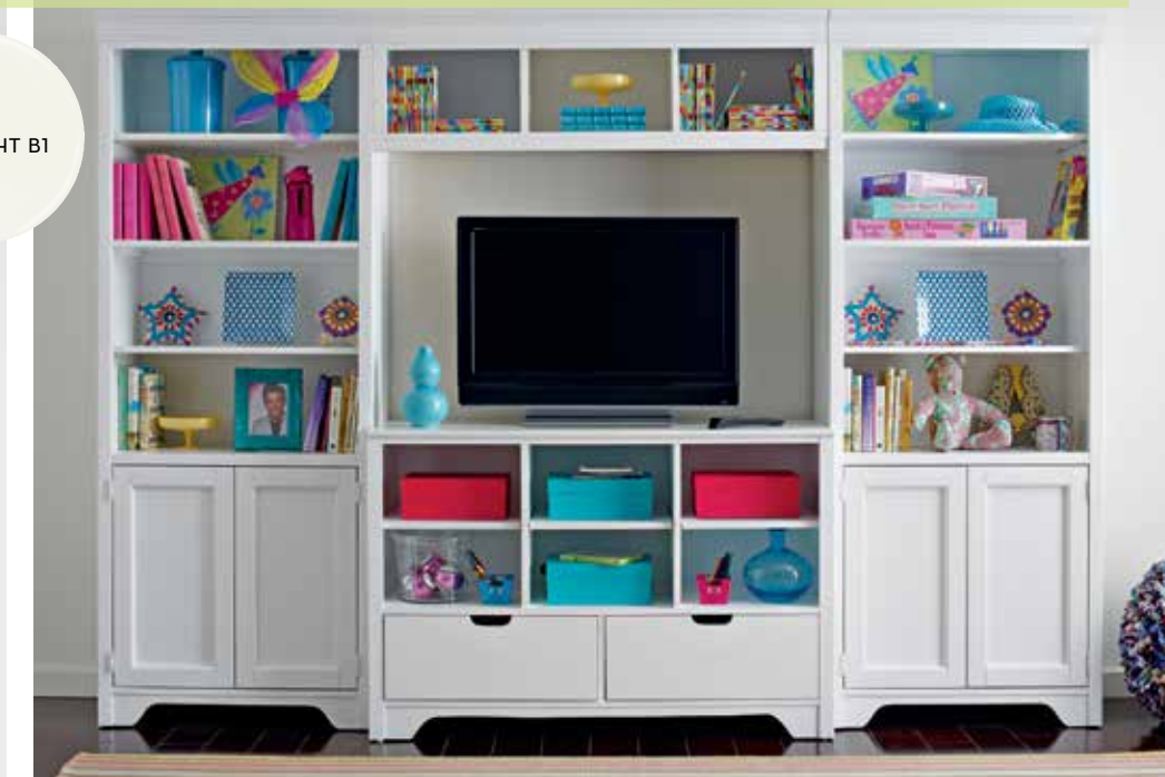
▲ DANA DOOR BOOKCASE (2) WAL-8295-B1 STARLIGHT, DANA STORAGE HUTCH WAL-8125-B1 STARLIGHT DANA LARGE CONSOLE WAL-8195-B1 STARLIGHT