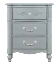
226-0082 ISABELLA 3 DRAWER NIGHT STAND 23 13/16W 18 3/8D 29 1/8H (60 x 47 x 74 cm)