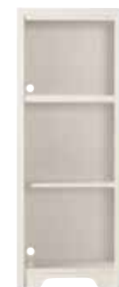
WAL-8255 DANA LOW BOOKCASE * 19 3/4W 10D 52H (50 x 25 x 132 cm)