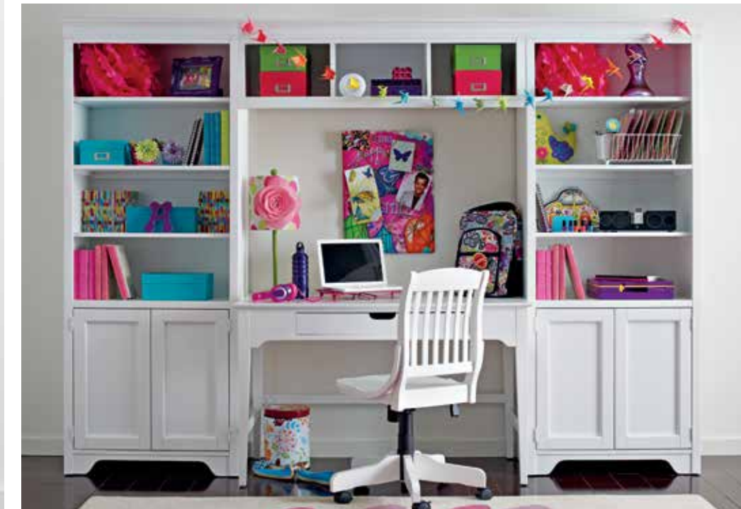
▲ DANA DOOR BOOKCASE (2) WAL-8295-B1 STARLIGHT, DANA STORAGE HUTCH WAL-8125-B1 STARLIGHT DANA WRITING DESK WAL-8226-B1 STARLIGHT, BAILEY BANKER CHAIR CHR-0071-B1 STARLIGHT