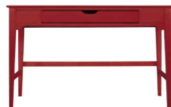
WAL-8226 DANA WRITING DESK * 49W 22 3/16D 30 3/16H (124 x 56 x 77 cm)