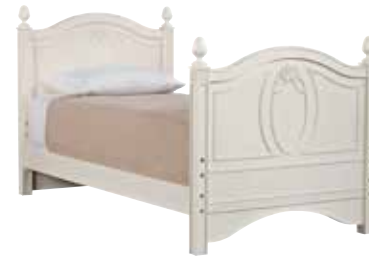
226-7350 ISABELLA BUNKABLE BED, TWIN Overall: 42 7/8W 45 13/16D 81 1/4H (109 x 116 x 206 cm)

CONSISTS OF: HBD-H554 NEWBERRY BOOKCASE HEADBOARD, FULL LPF-3291 LOW PROFILE FOOTBOARD, FULL RLS-0050 TWIN/FULL BED RAILS SET (HOOK) SLR-0468 SLAT ROLL, FULL