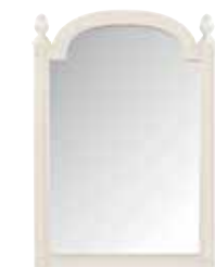
226-0032 ISABELLA VERTICAL MIRROR Overall: 28 1/2W 2 1/4D 43H (72 x 6 x 109 cm)