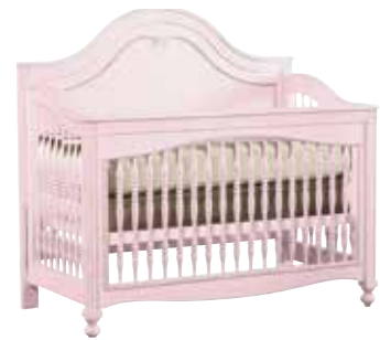
BTG-2800 BUILT TO GROW GALA CRIB Overall: 30 1/2W 53 13/16H 57 1/2L (77 x 137 x 146 cm)

CONSISTS OF: 226-H324 ISABELLA SONNET HEADBOARD, FULL 226-F324 ISABELLA SONNET FOOTBOARD, FULL RLS-0050 TWIN/FULL BED RAILS SET (HOOK) SLR-0468 SLAT ROLL, FULL