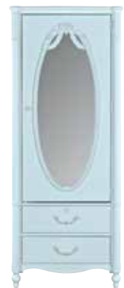
226-0015 ISABELLA WARDROBE 29 3/16W 20 7/8D 72 1/4H (74 x 53 x 184 cm)