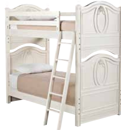
226-7300 ISABELLA BUNK BED, TWIN Overall: 42 3/8W 78H 81 1/4L (108 x 198 x 206 cm)

CONSISTS OF: 226-E400 ISABELLA BUNK BED ENDS, FULL SET RLS-0052 TWIN/FULL BED RAILS SET (BOLT) SLR-0468 SLAT ROLL, FULL