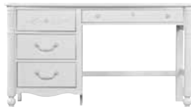
226-0227 ISABELLA COMPUTER DESK 53 13/16W 24D 30 3/8H (137 x 61 x 77 cm)