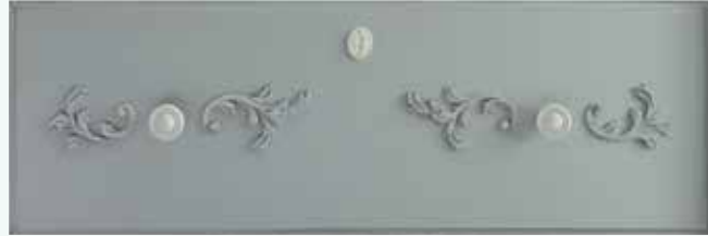
STANDARD PAINT TECHNIQUE

A SOLID CASE FOR SELF EXPRESSION. Constructed of kiln-dried, North American hardwoods and veneers, Isabella is a canvas prepared for your personalization with our new sophisticated palette. Tell a simple color story with one of our paints, or choose "Vintage Striped," the hand-painted highlighting of moldings and carvings in a contrasting color. Antique white pulls and knobs adorn the final work.