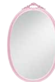
MIR-3180 OLIVIA OVAL MIRROR Overall: 26W 40 3/16H (66 x 102 cm)