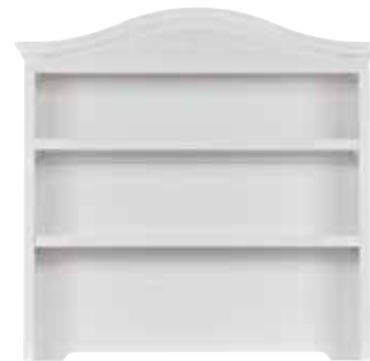
226-0224 ISABELLA HUTCH 52 1/2W 13 3/4D 51H (133 x 35 x 130 cm)