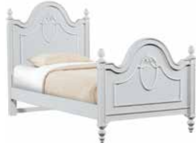
226-5333 ISABELLA CAMEO BED, TWIN Overall: 42 7/16W 52H 81 1/2L (108 x 132 x 207 cm)

CONSISTS OF: 226-H333 ISABELLA CAMEO HEADBOARD, TWIN 226-F333 ISABELLA CAMEO FOOTBOARD, TWIN RLS-0050 TWIN/FULL BED RAILS SET (HOOK) SLR-0368 SLAT ROLL, TWIN