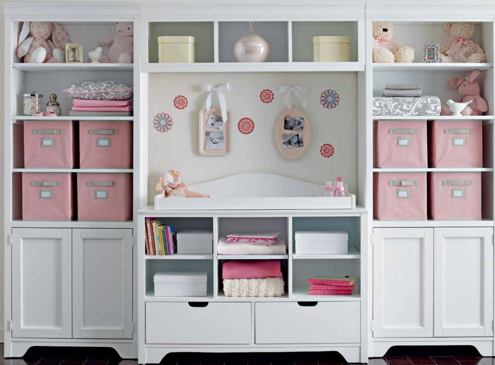
DANA DOOR BOOKCASE (2) WAL-8295-B1 STARLIGHT, DANA STORAGE HUTCH WAL-8125-B1 STARLIGHT DANA LARGE CONSOLE WAL-8195-B1 STARLIGHT, CHANGING STATION CHS-3305-B1 STARLIGHT

The accumulation of stuff – it starts before baby and mom come home from the hospital and never really stops. Give it all a home with our inspired, innovative wall units. Aside from the volumes of storage, you can tuck pieces into the wall units to stay ahead of your child's evolving needs: from a dresser with changing station, to a single bed, to a desk and chair perfectly sized for late-night study sessions. Every year, more new stuff. We're ready.