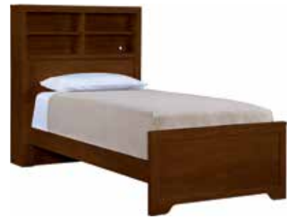
BED-5553 NEWBERRY BOOKCASE BED, TWIN * Overall: 44 1/16W 52H 87 15/16L (112 x 132 x 223 cm)

CONSISTS OF: HBD-H553 NEWBERRY BOOKCASE HEADBOARD, TWIN LPF-3286 LOW PROFILE FOOTBOARD, TWIN RLS-0050 TWIN/FULL BED RAILS SET (HOOK) SLR-0368 SLAT ROLL, TWIN