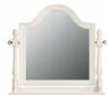
MIR-3155 TABITHA TILT MIRROR Overall: 30 3/8W 5 3/4D 23H (77 x 15 x 58 cm)