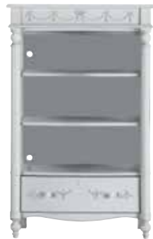
226-0013 ISABELLA BOOKCASE 32 15/32W 18 3/8D 54H (82 x 47 x 137 cm)