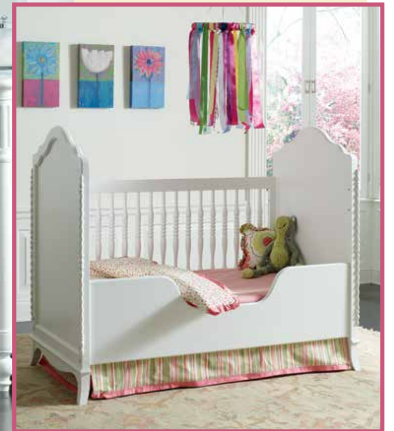
STATIONARY TODDLER RAIL KIT STK-3440-B1 STARLIGHT

Life speeds up when they transition to toddler. Good thing our crib is a quick change artist, converting to a toddler bed faster than you can say "I'm a big girl!"