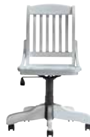
CHR-0071 BAILEY BANKER CHAIR * 17W 19 1/4D 38 1/4H (43 x 49 x 97 cm)