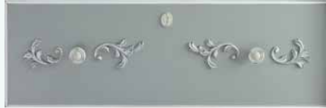
VINTAGE STRIPED TECHNIQUE