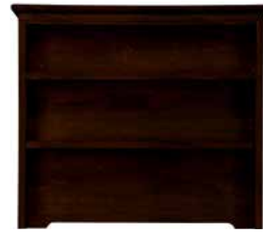
278-0224 HARBOR TOWN HUTCH 52 15/16W 13 15/16D 45 1/2H (134 x 35 x 116 cm)

NOTE: Young America may find it necessary to make changes to prices, colors, materials, equipment and specifications at any time or even discontinue certain items. We'll try not to, but our lawyers say we have to let you know that it could happen.