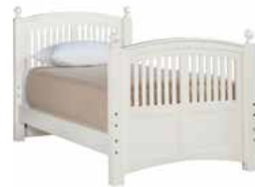
278-0750 HARBOR TOWN BUNKABLE BED, TWIN

CONSISTS OF: HBD-H554 NEWBERRY BOOKCASE HEADBOARD, FULL LPF-3291 LOW PROFILE FOOTBOARD, FULL RLS-0050 TWIN/FULL BED RAILS SET (HOOK) SLR-0468 SLAT ROLL, FULL