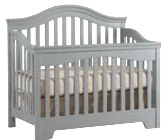
BTG-2000 BUILT TO GROW BRAVO CRIB Overall: 30 11/16W 51 1/2H 58 3/8L (78 x 131 x 148 cm)

Find a local retailer at youngamerica.com/locator