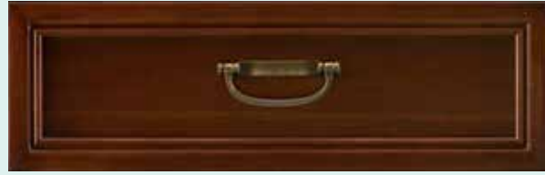
ANTIQUE BRASS HARDWARE ON WOOD TONES

Whether you choose to finish your furniture in a wood tone or one of our gorgeous paints, we've created the perfect hardware to complement your choice.