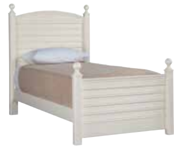
278-0035 HARBOR TOWN TOPSAIL BED, TWIN

Overall: 43 1/8W 54H 82 3/4L (110 x 137 x 210 cm)