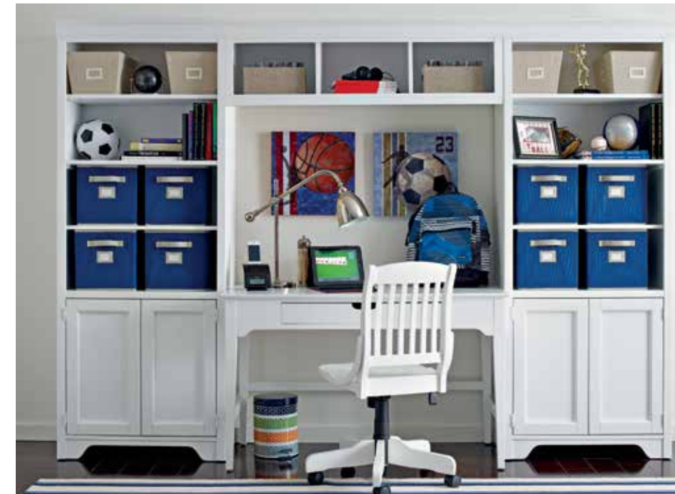
▲ DANA DOOR BOOKCASE (2) WAL-8295-B1 STARLIGHT, DANA STORAGE HUTCH WAL-8125-B1 STARLIGHT DANA WRITING DESK WAL-8226-B1 STARLIGHT, BAILEY BANKER CHAIR CHR-0071-B1 STARLIGHT