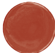
CHILI PEPPER P