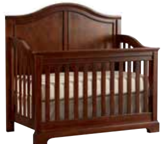
BTG-2250 BUILT TO GROW ACCLAIM CRIB Overall: 31 7/16W 55 1/16H 59L (80 x 140 x 150 cm)