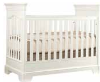
SSC-1400 TRIBUTE CRIB Overall: 32 3/8W 43 7/8H 57L (82 x 111 x 145 cm)