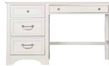
278-0227 HARBOR TOWN COMPUTER DESK 52 13/16W 23 1/2D 30 3/8H (134 x 60 x 77 cm)