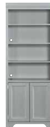
WAL-8295 DANA DOOR BOOKCASE 30W 15 11/16D 78H (76 x 40 x 198 cm)