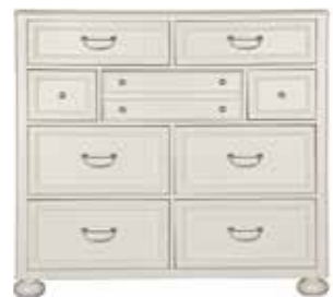
278-0004 HARBOR TOWN DRESSING CHEST 50 3/8W 19 3/8D 45 13/16H (128 x 49 x 116 cm)