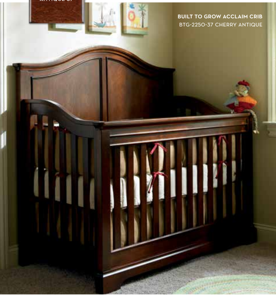
BUILT TO GROW ACCLAIM CRIB BTG-2250-37 CHERRY ANTIQUE

Safety always comes first at Young America where every single crib undergoes the independent, third-party scrutiny of Intertek Check. Their certification is your assurance that Young America is the safest children's furniture you can buy.