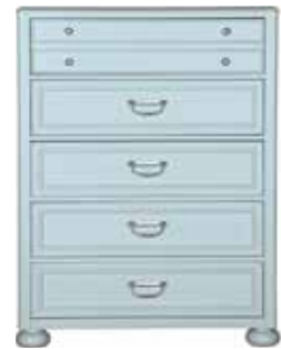
278-0012 HARBOR TOWN CHEST 38 1/8W 19 3/8D 49 11/16H (97 x 49 x 126 cm)