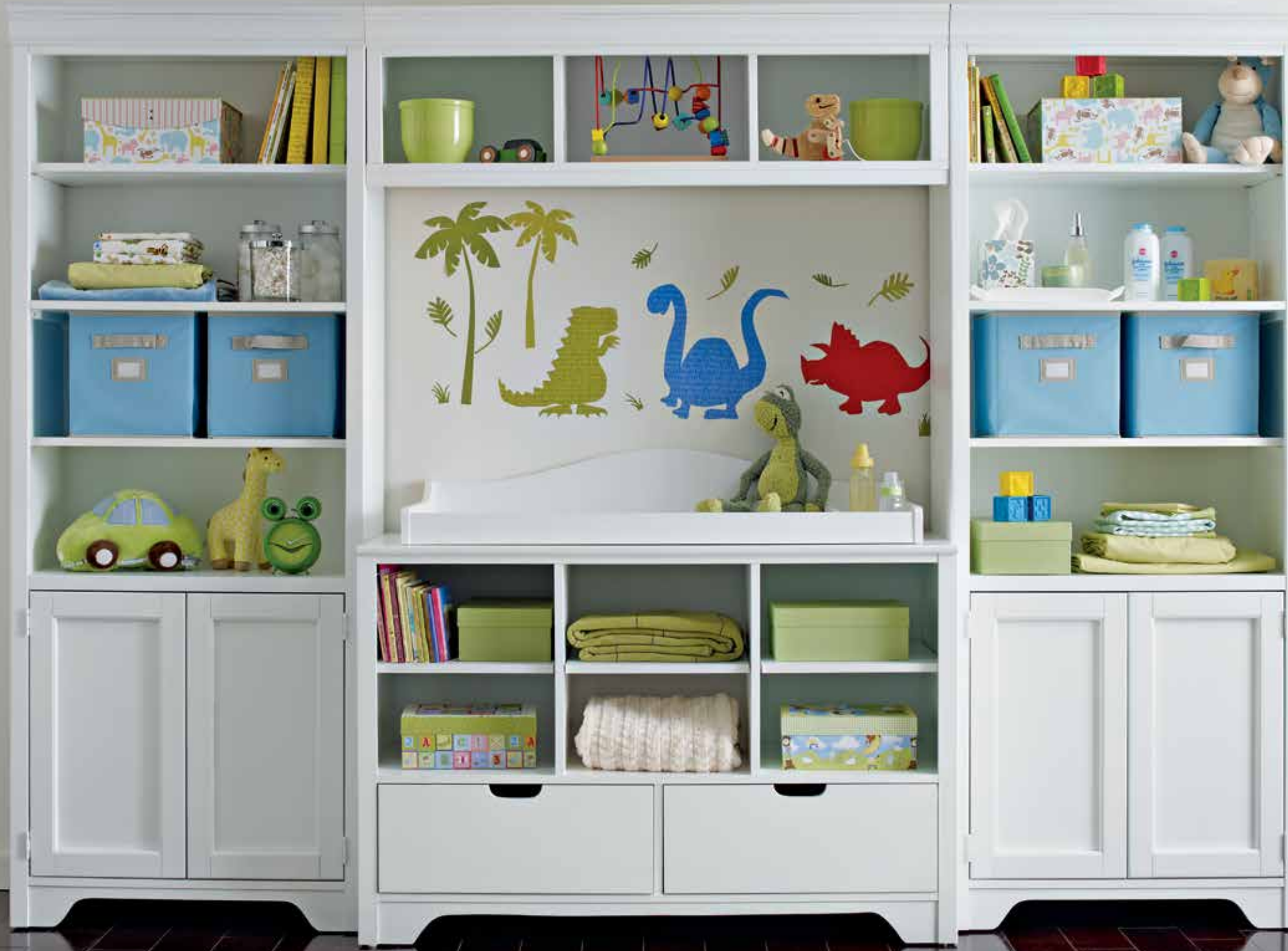
DANA DOOR BOOKCASE (2) WAL-8295-B1 STARLIGHT, DANA STORAGE HUTCH WAL-8125-B1 STARLIGHT DANA LARGE CONSOLE WAL-8195-B1 STARLIGHT, CHANGING STATION CHS-3305-B1 STARLIGHT

The accumulation of stuff – it starts before baby and mom come home from the hospital and never really stops. Give it all a home with our inspired, innovative wall units. Aside from the volumes of storage, you can tuck pieces into the wall units to stay ahead of your child's evolving needs: from a dresser with changing station, to a single bed, to a desk and chair perfectly sized for late-night study sessions. Every year, more new stuff. We're ready.