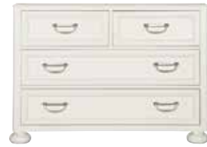
278-0001 HARBOR TOWN SINGLE DRESSER 45W 19 3/8D 31 15/16H (114 x 49 x 81 cm)