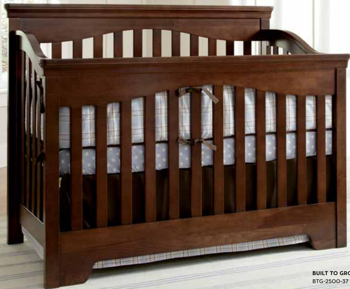
BUILT TO GROW DEBUT CRIB BTG-2500-37 CHERRY ANTIQUE