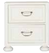
278-0082 HARBOR TOWN 2 DRAWER NIGHT STAND 22 3/4W 16 1/2D 25 1/16H (58 x 42 x 64 cm)