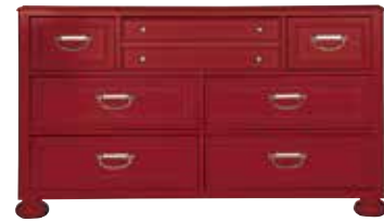
278-0002 HARBOR TOWN DOUBLE DRESSER 55 7/16W 19 3/8D 31 15/16H (141 x 49 x 81 cm)