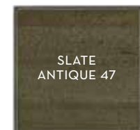
SLATE ANTIQUE 47

If algebra got the same attention as the kick-flip, here comes a scholarship.