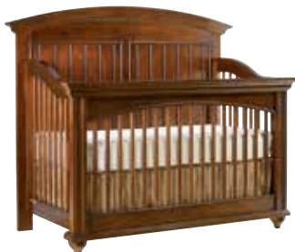
BTG-2600 BUILT TO GROW LAURELS CRIB Overall: 32 3/16W 54H 63 7/16L (82 x 137 x 161 cm)