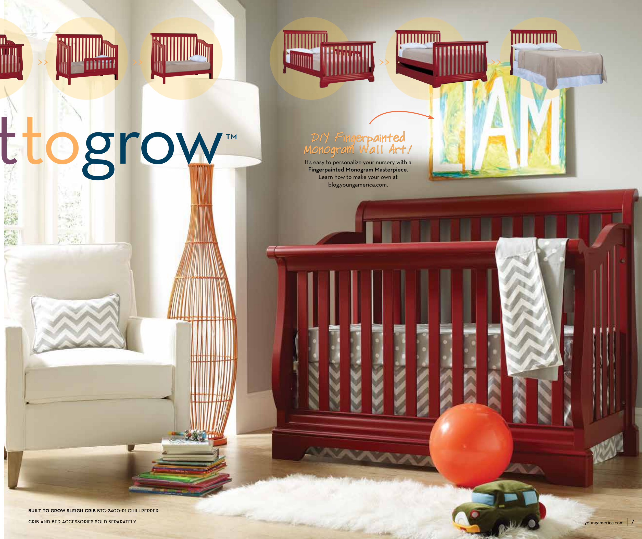
BUILT TO GROW SLEIGH CRIB BTG-2400-P1 CHILI PEPPER CRIB AND BED ACCESSORIES SOLD SEPARATELY