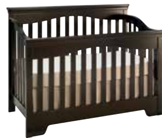
BTG-2500 BUILT TO GROW DEBUT CRIB Overall: 30 11/16W 46H 58L (78 x 117 x 147 cm)