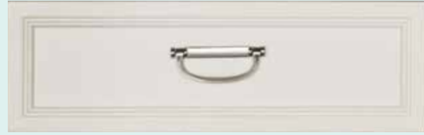
BRUSHED NICKEL HARDWARE ON PAINTS