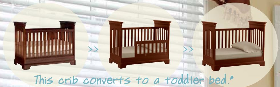
This crib converts to a toddler bed.*