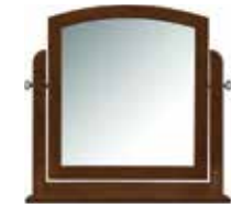
MIR-3125 TILLIE TILT MIRROR Overall: 30 3/8W 5 3/4D 29 1/8H (77 x 15 x 74 cm)