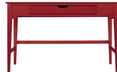
WAL-8226 DANA WRITING DESK 49W 22 3/16D 30 3/16H (124 x 56 x 77 cm)