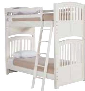
278-0770 HARBOR TOWN BUNK BED, TWIN Overall: 41 1/2W 75 1/2H 82L (105 x 192 x 208 cm)

CONSISTS OF: 278-0745 HARBOR TOWN BUNK BED ENDS FULL SET RLS-0052 TWIN/FULL BED RAILS SET (BOLT) SLR-0468 SLAT ROLL, FULL