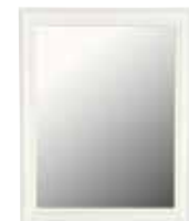
MIR-3133 VERTICAL MIRROR Overall: 32 3/4W 3/4D 39 3/8H (83 x 2 x 100 cm)

NOTE: Young America may find it necessary to make changes to prices, colors, materials, equipment and specifications at any time or even discontinue certain items. We'll try not to, but our lawyers say we have to let you know that it could happen.