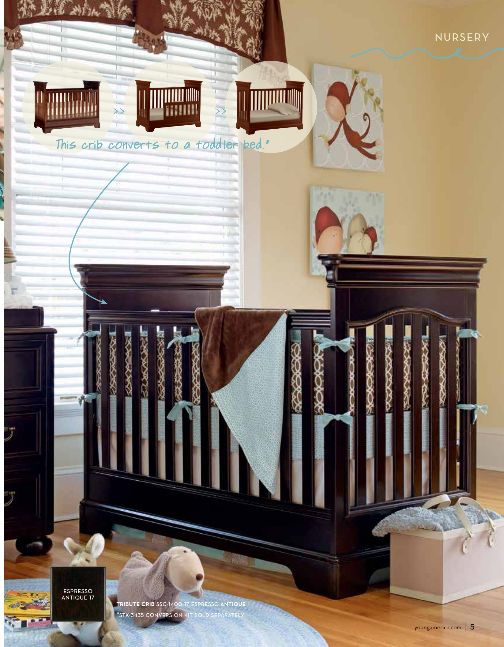
TRIBUTE CRIB SSC-1400-17 ESPRESSO ANTIQUE *STK-3435 CONVERSION KIT SOLD SEPARATELY