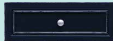
WEATHERED PAINT TECHNIQUE