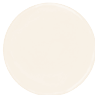
FRENCH WHITE C