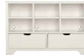
WAL-8195 DANA LARGE CONSOLE 49 1/4W 19 1/8D 33H (125 x 49 x 84 cm)