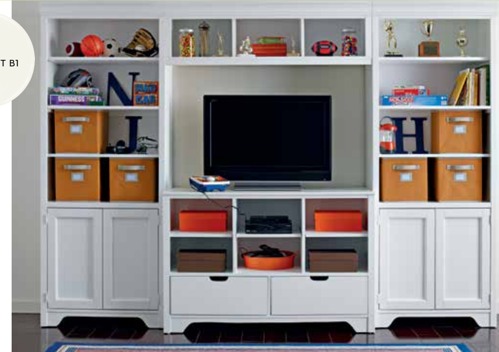
▲ DANA DOOR BOOKCASE (2) WAL-8295-B1 STARLIGHT, DANA STORAGE HUTCH WAL-8125-B1 STARLIGHT DANA LARGE CONSOLE WAL-8195-B1 STARLIGHT