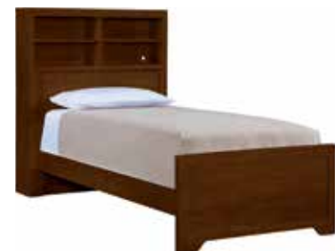
BED-5553 NEWBERRY BOOKCASE BED, TWIN Overall: 44 1/16W 52H 87 15/16L (112 x 132 x 223 cm)

CONSISTS OF: 278-0141 HARBOR TOWN TOPSAIL HEADBOARD, QUEEN 278-0241 HARBOR TOWN TOPSAIL FOOTBOARD, QUEEN RLS-0051 QUEEN BED RAILS SET (HOOK)