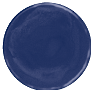
TRUE BLUE J