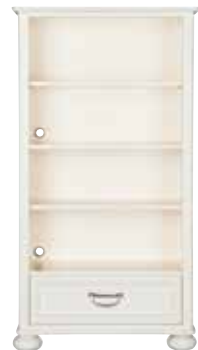
278-0013 HARBOR TOWN BOOKCASE 30 31/32W 17 1/4D 56 3/4H (79 x 44 x 144 cm)