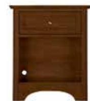
278-0080 HARBOR TOWN 1 DRAWER NIGHT STAND 21 11/16W 17 1/4D 25 3/16H (55 x 44 x 64 cm)