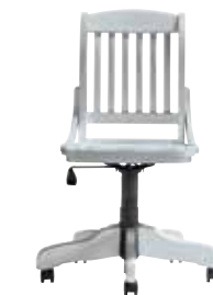
CHR-0071 BAILEY BANKER CHAIR * 17W 19 1/4D 38 1/4H (43 x 49 x 97 cm)