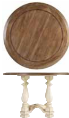
149-11-130 TOP, 149-21-230 BASE