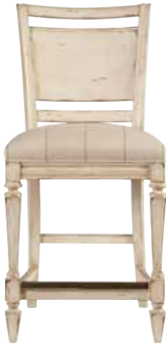
149-21-72 Counter Stool Belgian White finish (details p. 13)