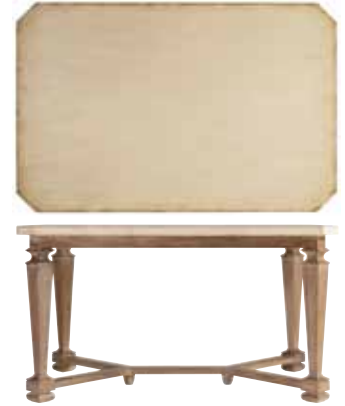
149-21-132 TOP, 149-11-232 BASE