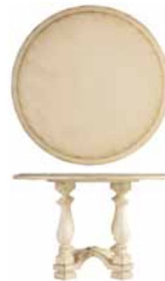
149-21-130 TOP, 149-21-230 BASE