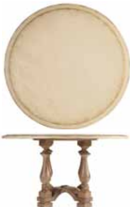
149-21-131 TOP, 149-11-230 BASE