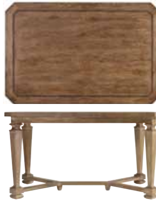
149-11-132 TOP, 149-11-232 BASE