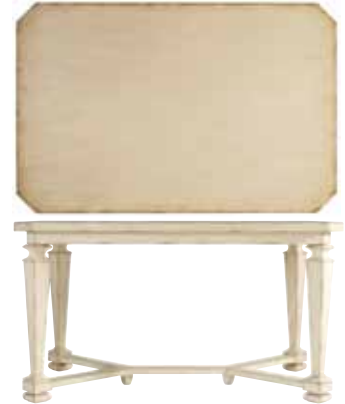
149-21-132 TOP, 149-21-232 BASE