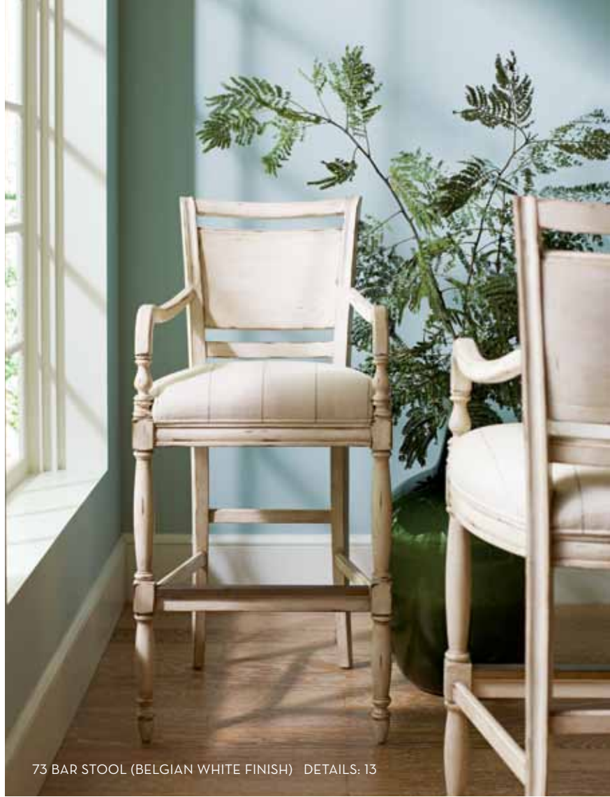
73 BAR STOOL (BELGIAN WHITE FINISH) DETAILS: 13