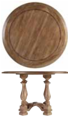
149-11-130 TOP, 149-11-230 BASE