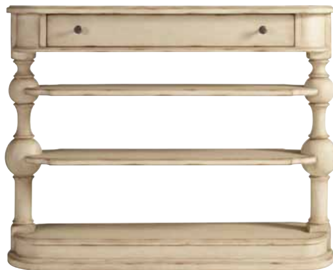
149-21-05 Sideboard Belgian White finish (details p. 12)

TOP: Classically-turned legs married to precise joinery offers elegance in any setting.