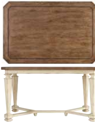
149-11-132 TOP, 149-21-232 BASE