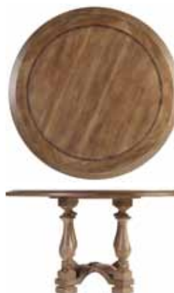
149-11-131 TOP, 149-11-230 BASE