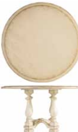
149-21-131 TOP, 149-21-230 BASE