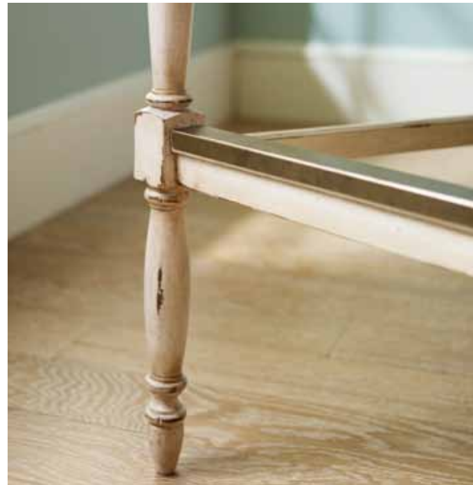
ABOVE: Kick plates protect the footrests of Bar and Counter Stools.