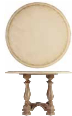
149-21-130 TOP, 149-11-230 BASE