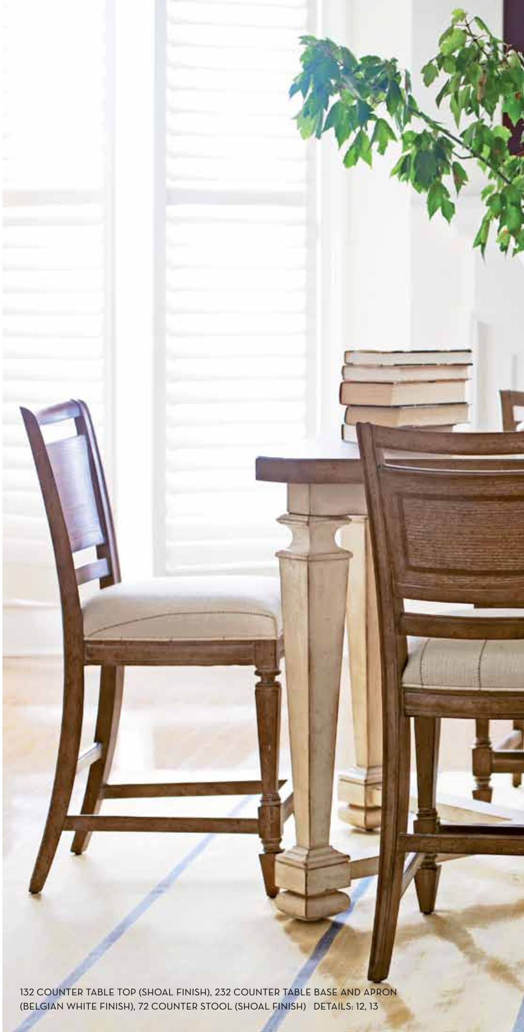
132 COUNTER TABLE TOP (SHOAL FINISH), 232 COUNTER TABLE BASE AND APRON (BELGIAN WHITE FINISH), 72 COUNTER STOOL (SHOAL FINISH) DETAILS: 12, 13

BOTTOM: Simple turning adds a grace note to the substantial stacked architecture of the table top and legs.