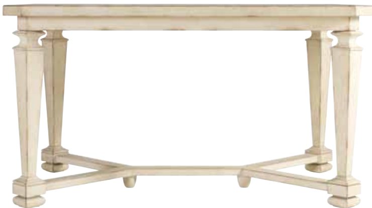
149-21-132 Counter Table Top 149-21-232 Counter Table Base and Apron Belgian White finish (details p. 12)