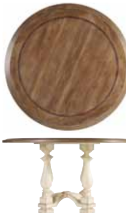
149-11-131 TOP, 149-21-230 BASE