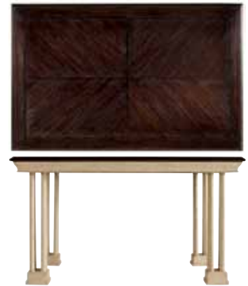
138-11-132 TOP, 138-21-232 BASE