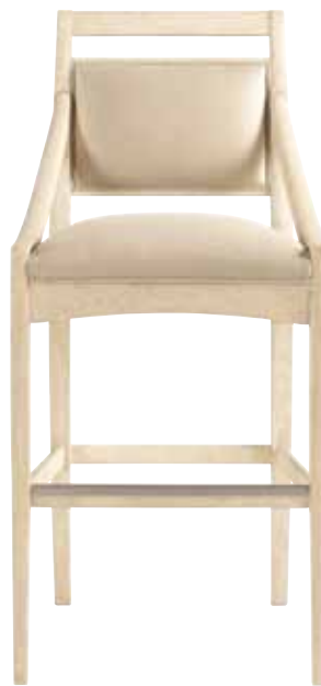
138-21-73 Bar Stool Alabaster finish (details p. 13)

TOP: When beauty meets utility, art results: a pullout shelf doubles the Sideboard's work surface.