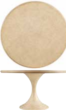
138-21-131 TOP, 138-21-230 BASE