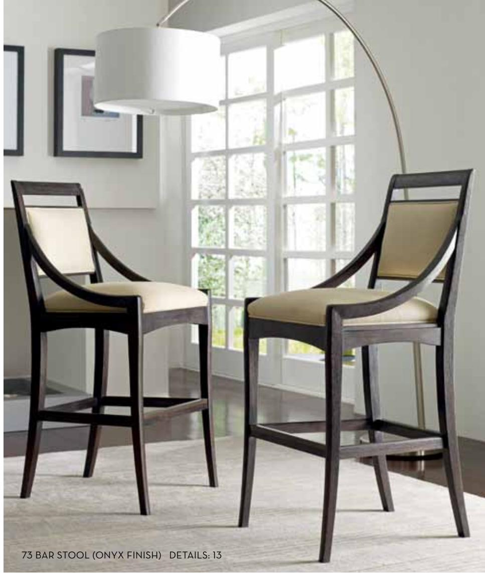
73 BAR STOOL (ONYX FINISH) DETAILS: 13