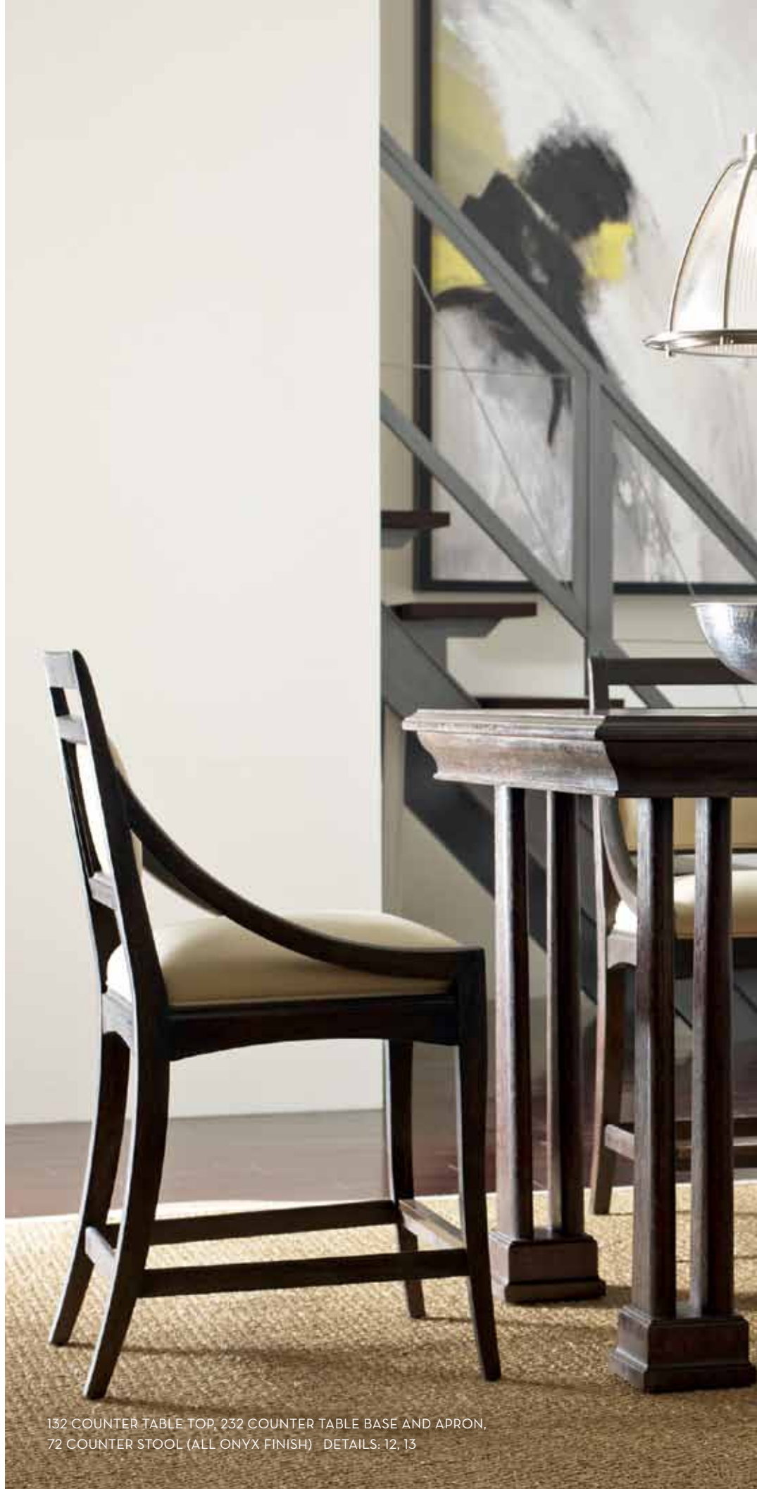
132 COUNTER TABLE TOP, 232 COUNTER TABLE BASE AND APRON, 72 COUNTER STOOL (ALL ONYX FINISH) DETAILS: 12, 13

BOTTOM: The oval shaping of double-pillar table legs whispers Art Deco and softens the look.