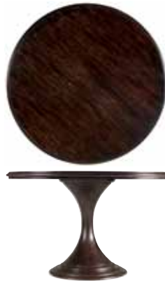
138-11-130 TOP, 138-11-230 BASE