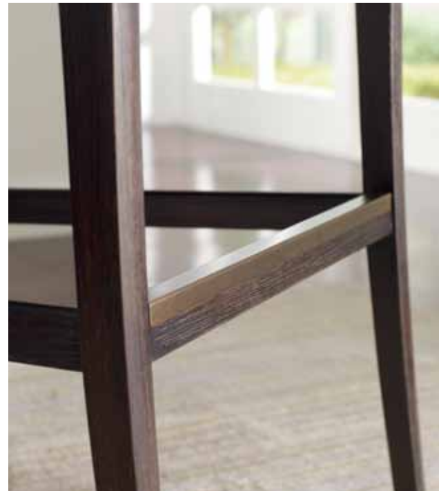
ABOVE: Kick plates protect the footrests of bar and counter stools.