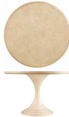
138-21-130 TOP, 138-21-230 BASE