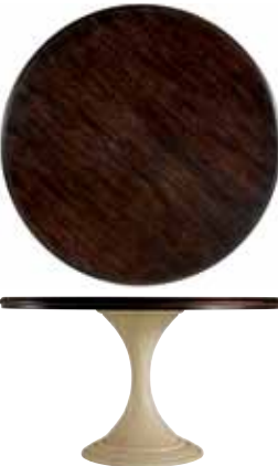
138-11-131 TOP, 138-21-230 BASE