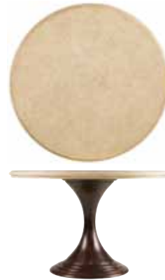
138-21-130 TOP, 138-11-230 BASE