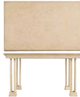
138-21-132 TOP, 138-21-232 BASE