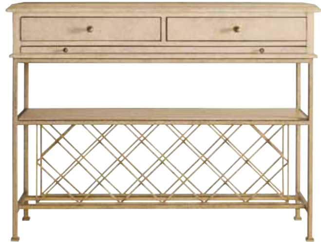
138-21-05 Sideboard Alabaster finish (details p. 12)