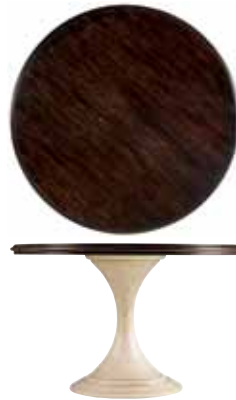
138-11-130 TOP, 138-21-230 BASE