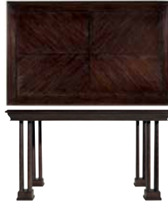
138-11-132 TOP, 138-11-232 BASE