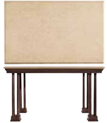
138-21-132 TOP, 138-11-232 BASE