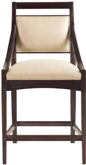
138-11-72 Counter Stool Onyx finish (details p. 13)