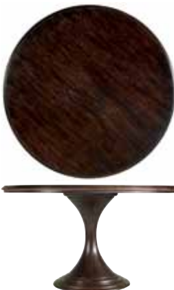
138-11-131 TOP, 138-11-230 BASE