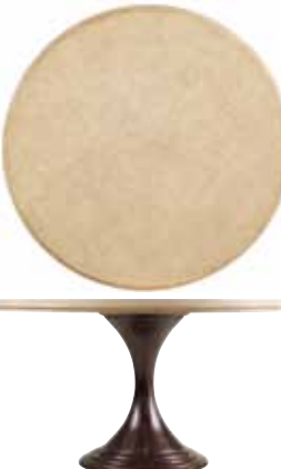
138-21-131 TOP, 138-11-230 BASE