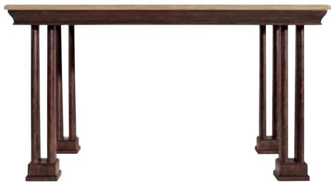
138-21-132 Counter Table Top Alabaster finish