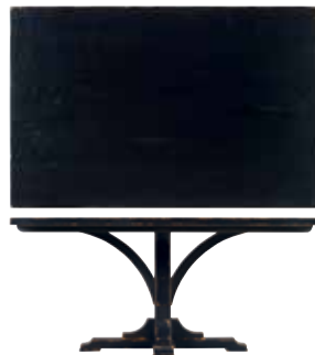
135-81-136 TOP, 135-81-236 BASE