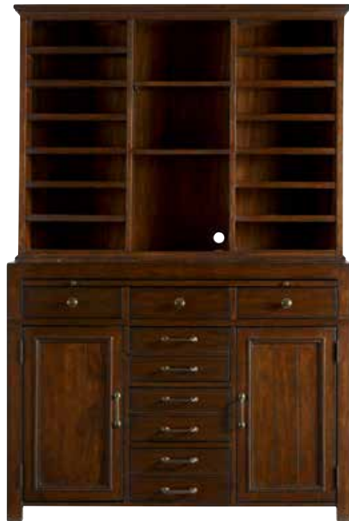
135-11-106 Wine Hutch 48 3/8W 9 3/8D 37H