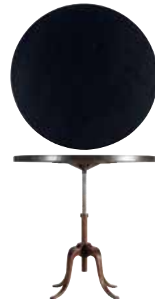
BAR HEIGHT: 42H