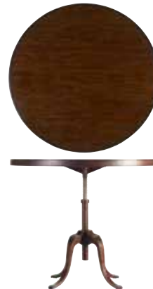
COUNTER HEIGHT: 36H