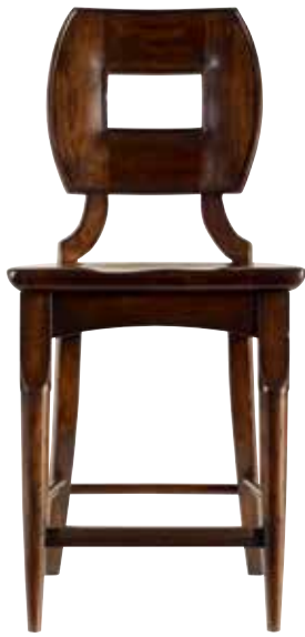
135-11-72 Wood Counter Stool Barrel 19W 21 3/4D 41H (details p. 13)