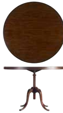
DINING HEIGHT: 30H