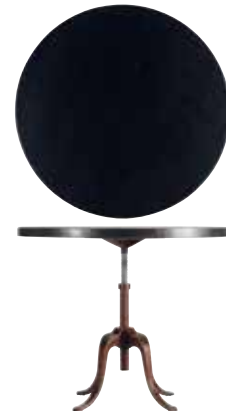
COUNTER HEIGHT: 36H