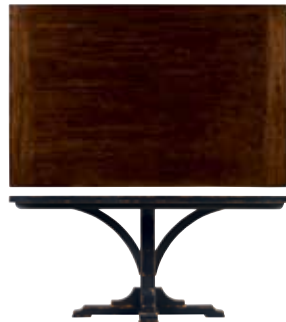
135-11-136 TOP, 135-81-236 BASE