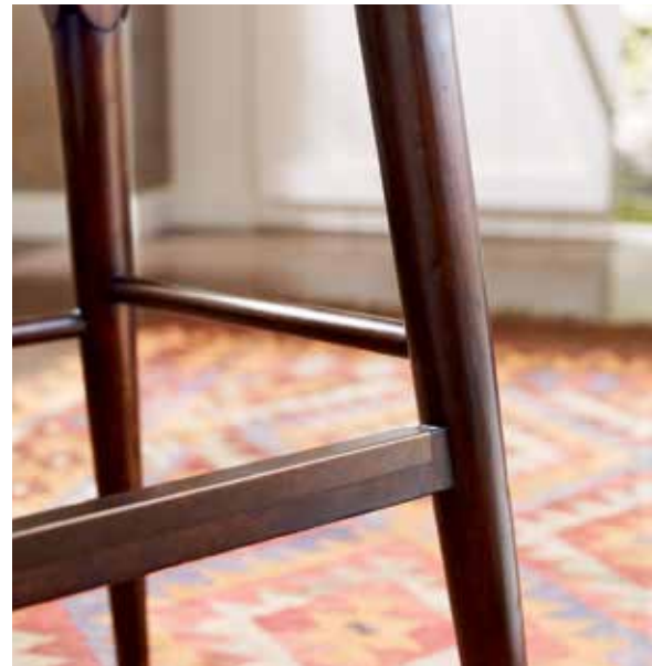
ABOVE: Kick plates protect the footrests of the Wood Bar and Counter Stools.