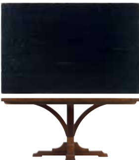
135-81-136 TOP, 135-11-236 BASE