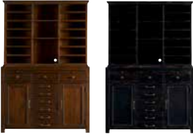
135-11-06 BUFFET, Barrel

Select hardwood solids with mahogany veneers and metal accents