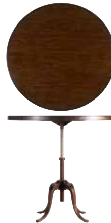
BAR HEIGHT: 42H