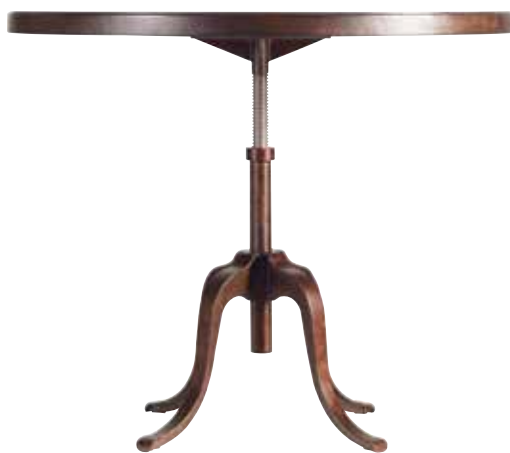
135-11-130 44" Round Table Top Barrel 44 DIAMETER 2H