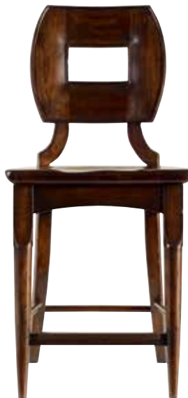
135-11-72 Wood Counter Stool Barrel 19W 21 3/4D 41H (details p. 13)

TOP: Why not display wine collections as accents? There's ample storage in the Wine Hutch for up to 28 bottles.