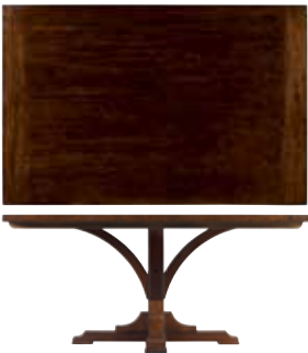
135-11-136 TOP, 135-11-236 BASE