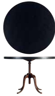
DINING HEIGHT: 30H