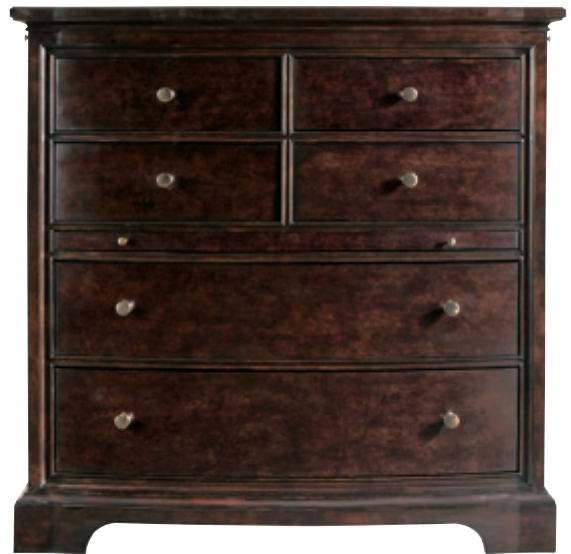
O42-13-11 Media Chest Polished Sable (details p. 8)