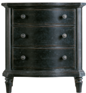
007-83-80 Night Stand Chalkboard (details p. 12)