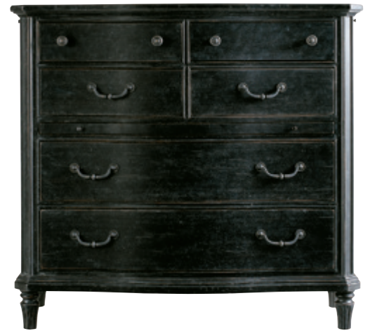
007-83-11 Media Chest Chalkboard (details p. 12)