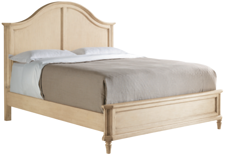
007-23-45 Panel Bed Vintage White (details p. 12)

BOTTOM: An exquisite detail, tapered feet are as sturdy as they are graceful.