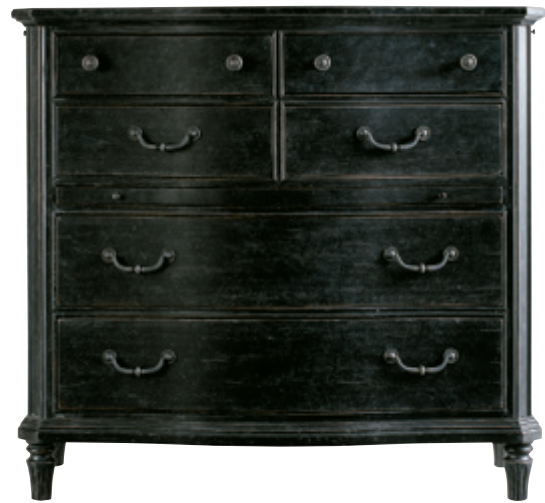
007-83-11 Media Chest Chalkboard (details p. 12)

BOTTOM: Pen a note or simply display beloved trinkets with the Media Chest's pullout writing surface.