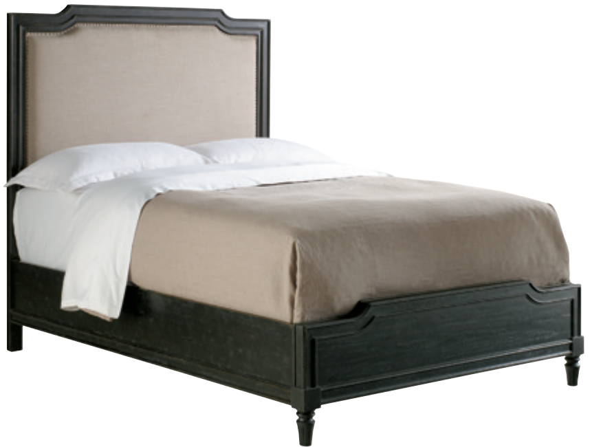
007-83-52 Upholstered Bed Chalkboard (details p. 13)