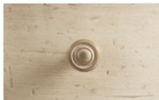
VINTAGE WHITE KNOB