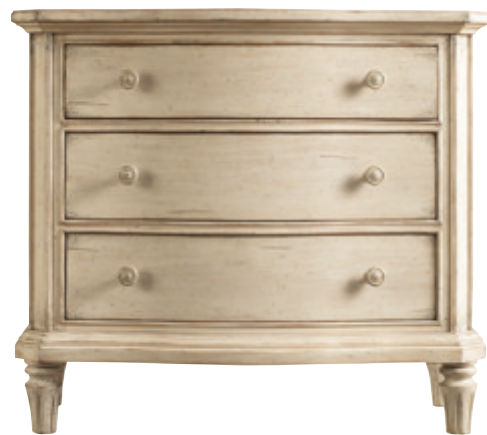
007-23-16 Bachelor's Chest Vintage White (details p. 12)