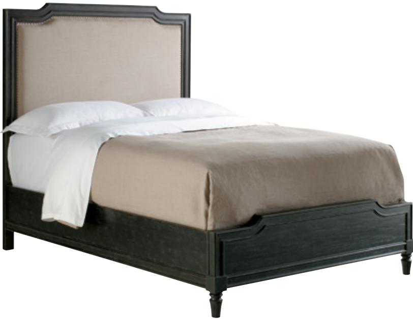
007-83-52 Upholstered Bed Chalkboard (details p. 13)