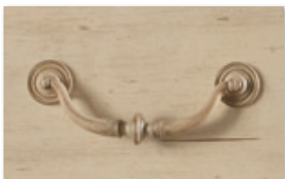
VINTAGE WHITE PULL

Intricate, yet substantial, the metal hardware used on European Cottage is finished on the case, ensuring that the look is consistent with the entirety of the design. Finely sculpted bails and simple, but detailed, knobs meld perfectly with the sensibility of the collection.