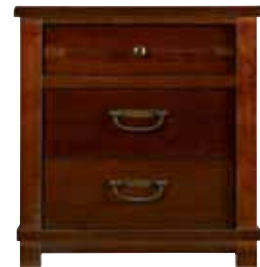
890-0082-37 Night Stand RUSTIC CHERRY ANTIQUE 37 (details p. 23)

shown on p. 15 with TSU-0069-37 Underbed Trundle Unit (details p. 22)