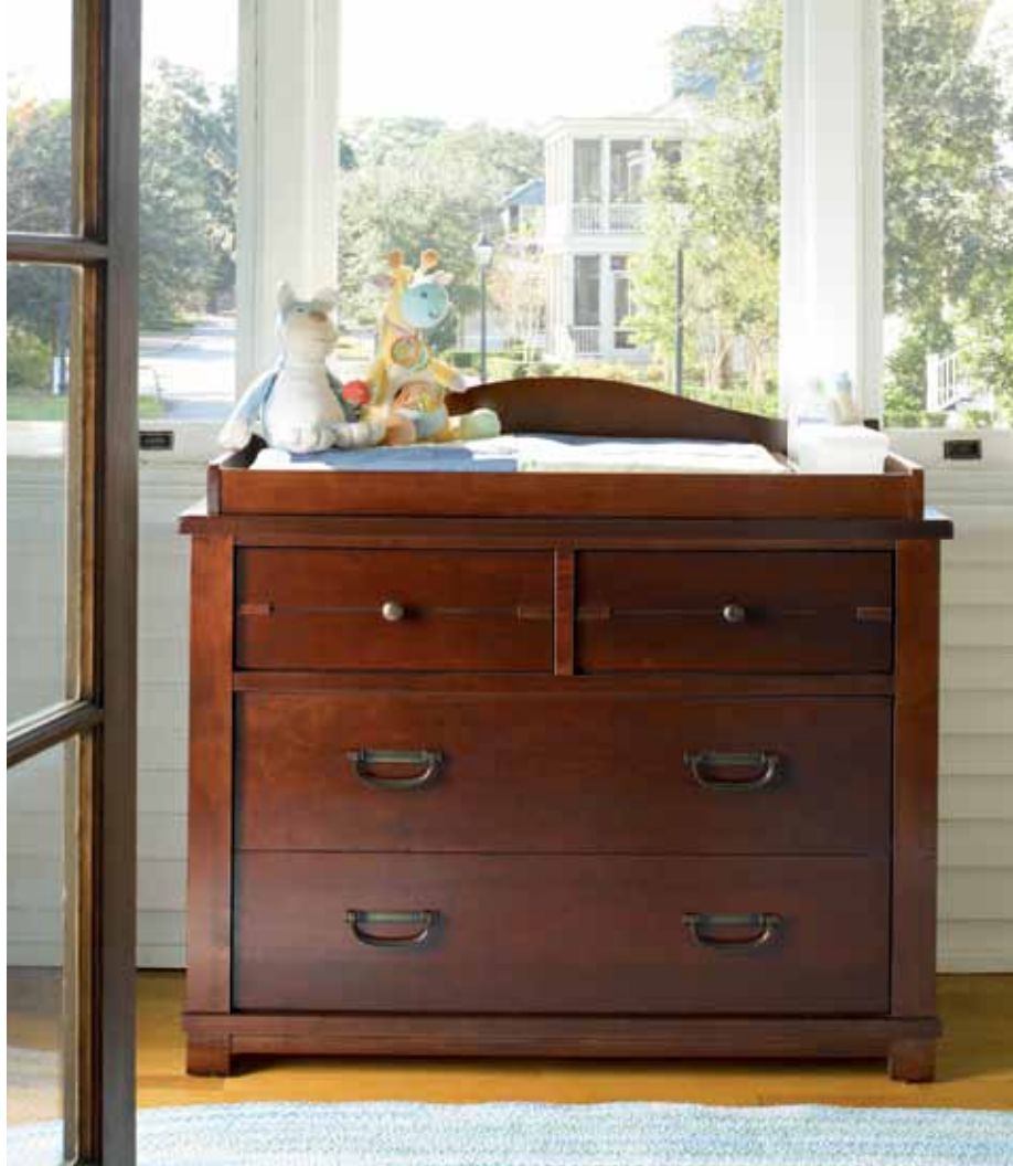
890-0001-37 Single Dresser RUSTIC CHERRY ANTIQUE 37 (details p. 23)