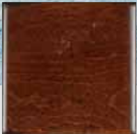
RUSTIC CHERRY ANTIQUÉ 37