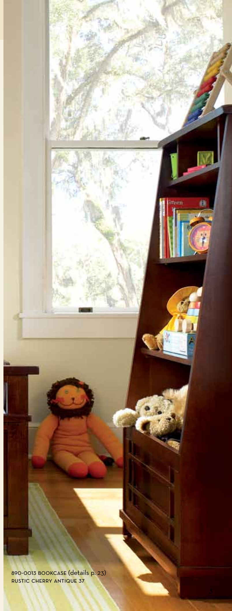
890-0013 BOOKCASE (details p. 23) RUSTIC CHERRY ANTIQUE 37

Provides additional sleep and storage room when space is at a premium.