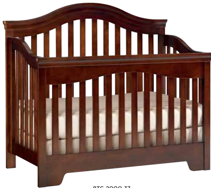
BTG-2000-37 Built to Grow Slat Crib RUSTIC CHERRY ANTIQUE 37 (details p. 20)