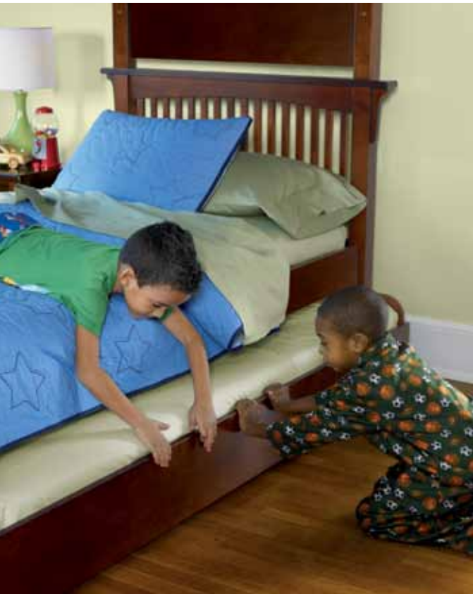
A handy pullout trundle makes sleepovers a cinch.