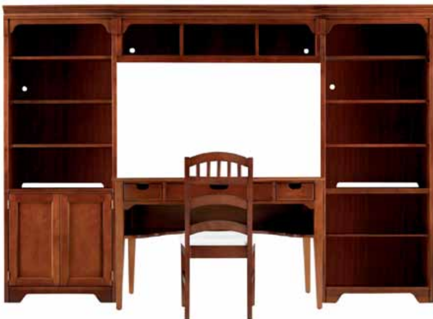
WAL-8290-37 Door Bookcase RUSTIC CHERRY ANTIQUE 37 (details p. 25)