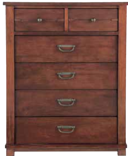
890-0012-37 Drawer Chest RUSTIC CHERRY ANTIQUE 37 (details p. 23)