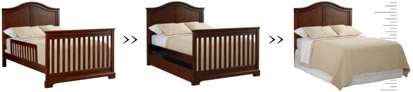
Additional items may be needed to convert crib as displayed. Please consult your retailer.