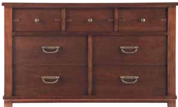
890-0002-37 Double Dresser RUSTIC CHERRY ANTIQUE 37 (details p. 23)