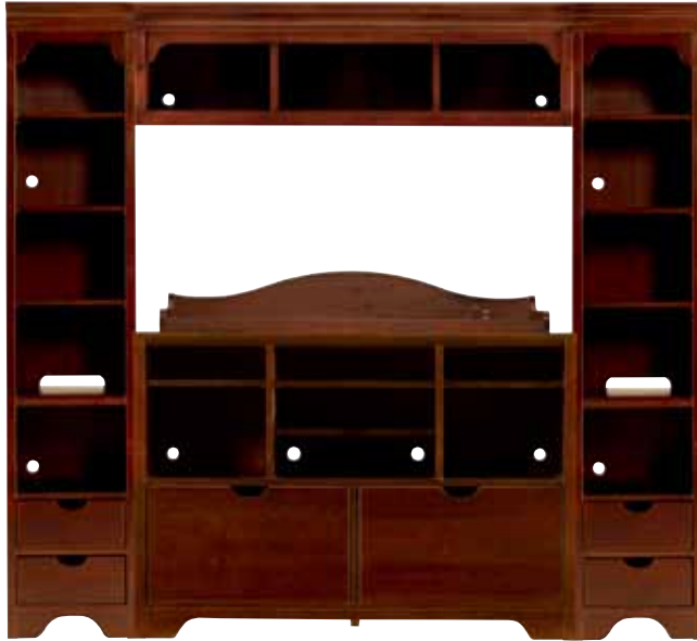
WAL-8260-37 Narrow Bookcase RUSTIC CHERRY ANTIQUE 37 (details p. 25)