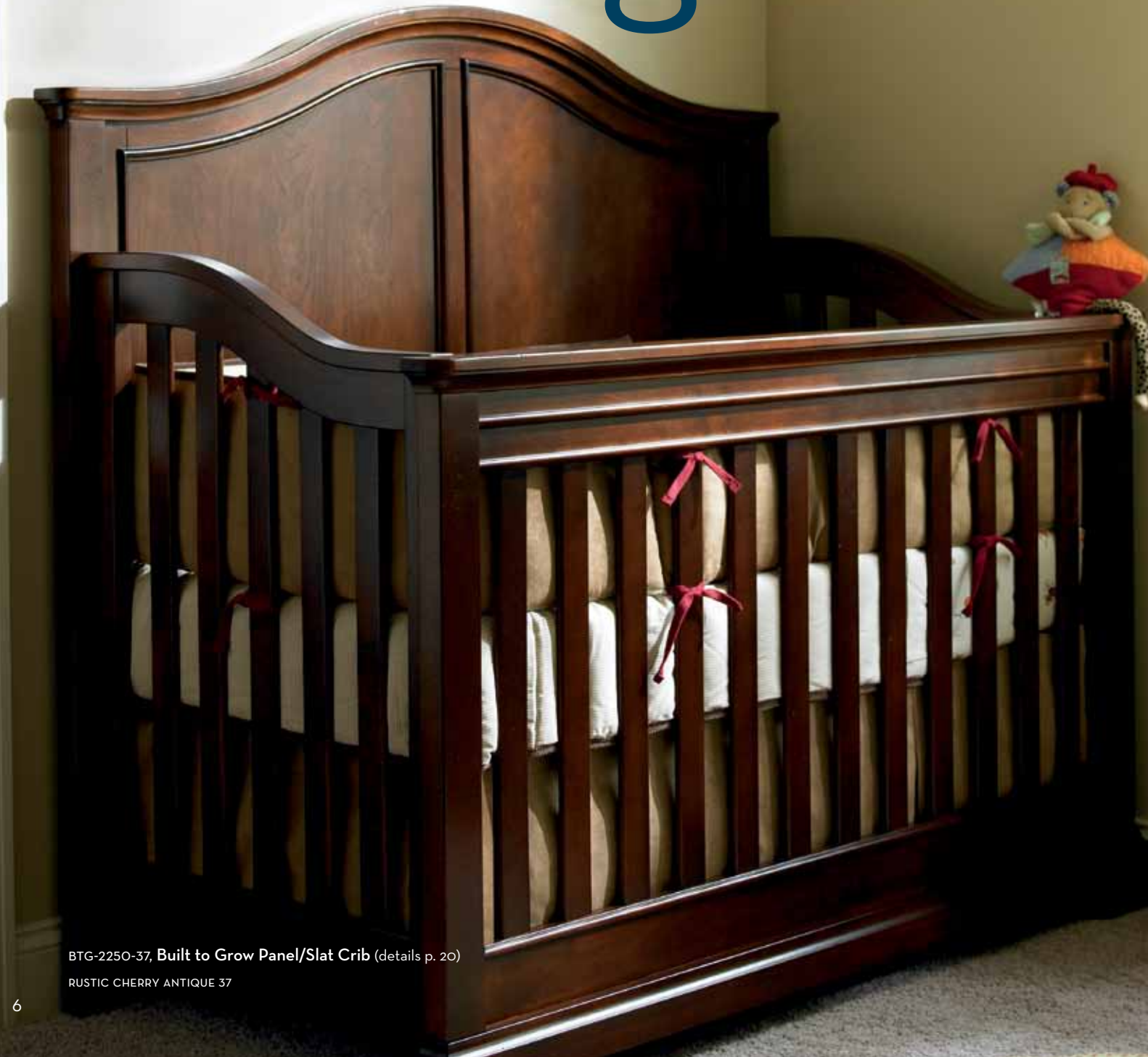
BTG-2250-37, Built to Grow Panel/Slat Crib (details p. 20) RUSTIC CHERRY ANTIQUE 37