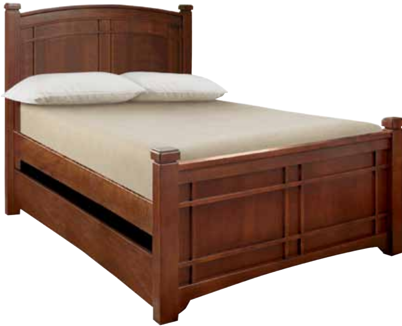
890-0041-37 Double Low Post Panel Bed RUSTIC CHERRY ANTIQUE 37 (details p. 21)

shown on p. 15 with TSU-0069-37 Underbed Trundle Unit (details p. 22)