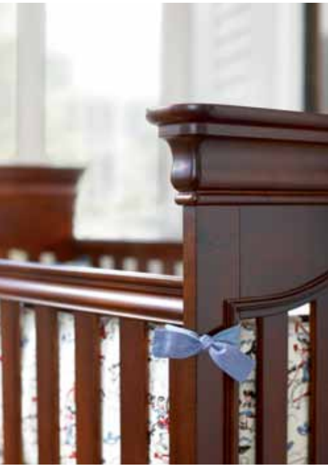
Cap molding on the Stationary Crib's head and footboard add polish and style.