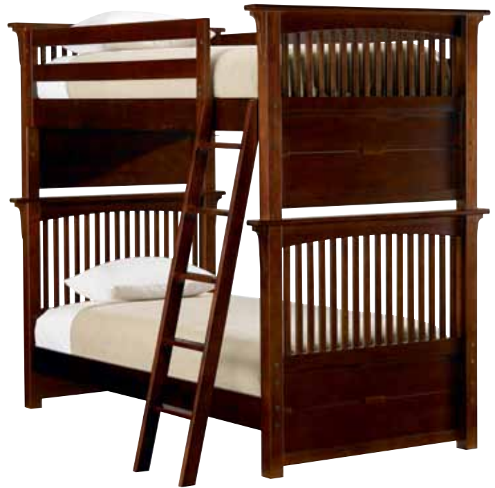
890-0770-37 Twin Bunk Bed RUSTIC CHERRY ANTIQUE 37 (details p. 22)

shown on p. 12 with TSU-0069-37 Underbed Trundle Unit (details p. 22)