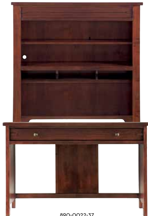
890-0022-37 Hutch (details p. 24)