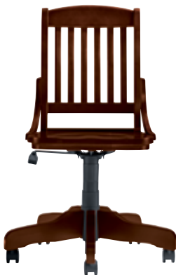
CHR-0071-37 Banker's Chair RUSTIC CHERRY ANTIQUE 37 (details p. 24)