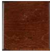
RUSTIC CHERRY ANTIQUE 37

Rustic Cherry Antique – Basecamp is crafted from maple and select hardwood solids, plus cherry veneers and hand finished in rich warm cherry with heavy distressing such as fly-specking, worm holes and rasping.