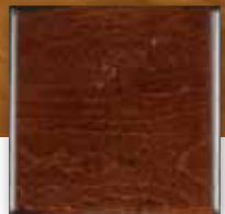
RUSTIC CHERRY ANTIQUE 37