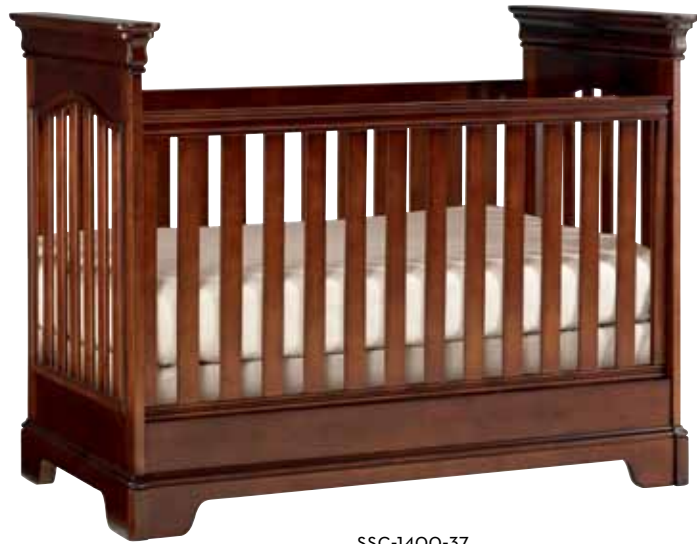
SSC-1400-37 Stationary Crib RUSTIC CHERRY ANTIQUE 37 (details p. 20)