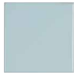
SKY BLUE N1

Northern hard white maple with select hardwood solids and white maple veneers give this collection its strength. Now you give it heart. Style it in a range of hand-rubbed stains and paint options that include Sand Thru, an aging effect around soft corners and wood drawer pulls.