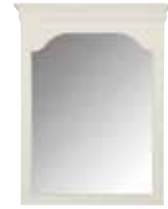
225-0032 ALL SEASONS MIRROR Overall: 34 1/4W 2 3/8D 43 11/16H (87 x 6 x 111 cm)