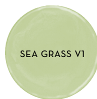
ALL SEASONS CHEST 225-0012-V1 SEA GRASS

Cleats today, ballet slippers tomorrow, next week...who knows?