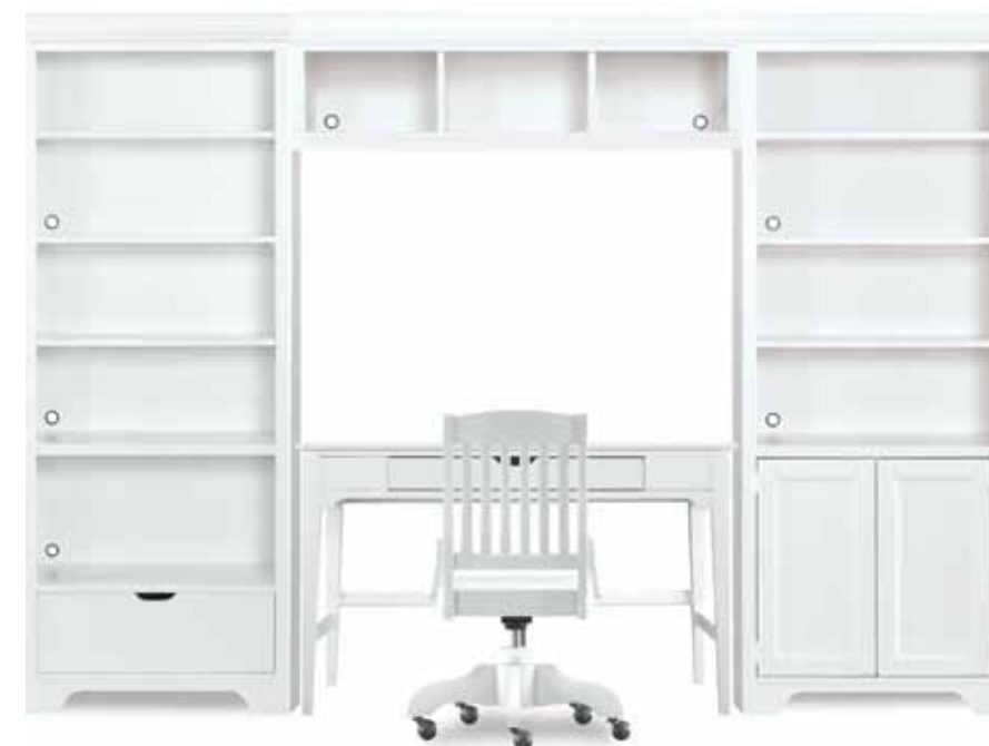
◀ DANA DRAWER BOOKCASE WAL-8285-B1 STARLIGHT DANA STORAGE HUTCH WAL-8125-B1 STARLIGHT DANA DOOR BOOKCASE WAL-8295-B1 STARLIGHT DANA WRITING DESK WAL-8225-B1 STARLIGHT BAILEY BANKER CHAIR CHR-0071-B1 STARLIGHT