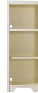
WAL-8255 DANA LOW BOOKCASE 19 3/4W 10D 52H (50 x 25 x 132 cm)