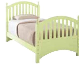
225-7360 ALL SEASONS BUNKABLE BED, TWIN Overall: 42 3/8W 47 9/16H 81 1/4L (108 x 121 x 206 cm)