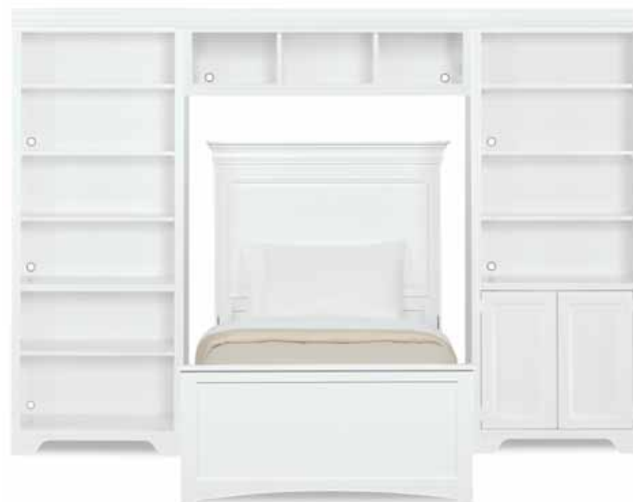
▶ DANA OPEN BOOKCASE WAL-8275-B1 STARLIGHT DANA STORAGE HUTCH WAL-8125-B1 STARLIGHT DANA DOOR BOOKCASE WAL-8295-B1 STARLIGHT ALL SEASONS LOUIS BED, TWIN 225-5193-B1 STARLIGHT