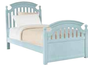
225-5793 ALL SEASONS BANNISTER BED, TWIN Overall: 42 1/4W 51H 81 7/8L (107 x 130 x 208 cm)