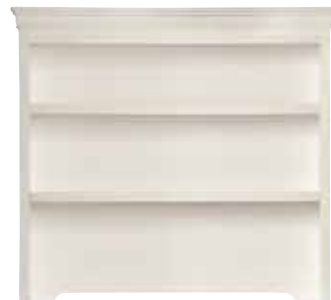
225-0224 ALL SEASONS HUTCH 52 7/8W 14D 47 1/4H (134 x 36 x 120 cm)