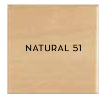
◀ ALL SEASONS WRITING DESK 225-0025-51 NATURAL