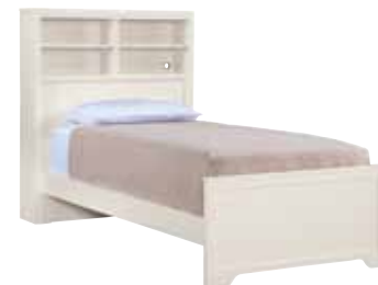
BED-5553 NEWBERRY BOOKCASE BED, TWIN Overall: 44 1/16W 52H 87 15/16L (112 x 132 x 223 cm)