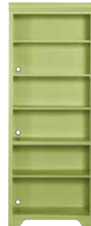
WAL-8275 DANA OPEN BOOKCASE 30W 15 11/16D 78H (76 x 40 x 198 cm)