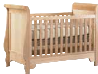
SSC-1000 GRAND SLEIGH CRIB Overall: 30W 43 13/16H 61 3/8L (76 x 111 x 156 cm)