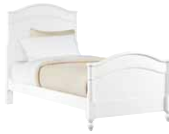
225-5423 ALL SEASONS ANTIQUITY BED, TWIN Overall: 42 7/8W 52 1/4H 81 3/4L (109 x 133 x 208 cm)