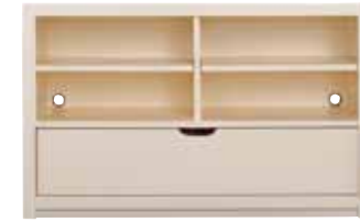
NMC-4105 DANA NESTING MEDIA CHEST 41 1/2W 19 1/8D 25 3/4H (105 x 49 x 65 cm)