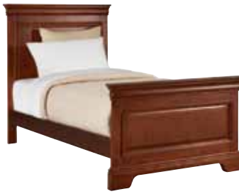
225-5193 ALL SEASONS LOUIS BED, TWIN Overall: 44 1/4W 50 13/16H 79 3/16L (112 x 129 x 201 cm) CONSISTS OF: 225-H193 LOUIS PHILIPPE HEADBOARD TWIN 225-F193 LOUIS PHILIPPE FOOTBOARD TWIN RLS-0050 TWIN/FULL BED RAILS SET (HOOK) SLR-0368 SLAT ROLL, TWIN