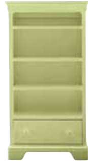
225-0013 ALL SEASONS BOOKCASE 31 13/32W 17 13/16D 58 1/8H (80 x 45 x 148 cm)