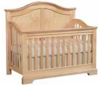
BTG-2250 BUILT TO GROW ACCLAIM CRIB Overall: 31 7/16W 55 1/16H 59L (80 x 140 x 150 cm)