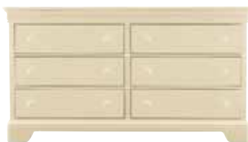
225-0005 ALL SEASONS DRESSER 63 15/16W 20 11/16D 35 7/8H (162 x 53 x 91 cm)