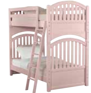
225-7310 ALL SEASONS BUNK BED, TWIN Overall: 42 3/8W 72 1/2H 81 1/4L (108 x 184 x 206 cm)