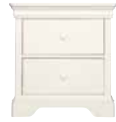
225-0082 ALL SEASONS 2 DRAWER NIGHT STAND 24 11/16W 17 13/16D 25 1/2H (63 x 45 x 65 cm)