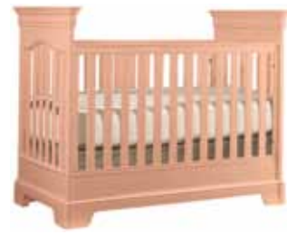
SSC-1400 TRIBUTE CRIB Overall: 32 3/8W 43 7/8H 57L (82 x 111 x 145 cm)