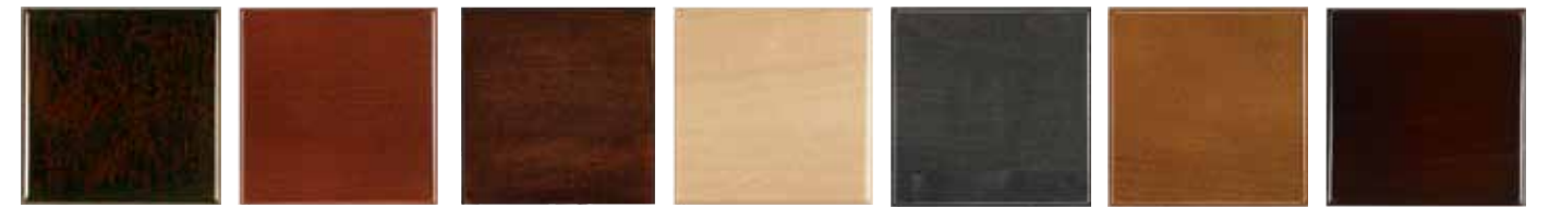
ESPRESSO 11 CINNAMON 21 RUSTIC CHERRY 31 NATURAL 51 GRAPHITE 71 WALNUT 81 MERLOT 91