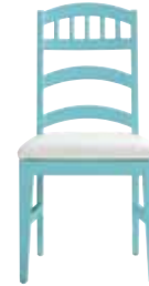
CHR-0070 DREW DESK CHAIR 18 7/8W 18 5/8D 34 5/16H (48 x 47 x 87 cm)