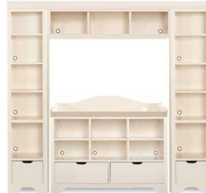
◀ DANA NARROW BOOKCASE WAL-8265-Q1 CREME DANA STORAGE HUTCH WAL-8125-Q1 CREME DANA NARROW BOOKCASE WAL-8265-Q1 CREME CHANGING STATION CHS-3300-Q1 CREME DANA LARGE CONSOLE WAL-8195-Q1 CREME