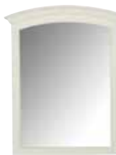
225-0034 ALL SEASONS ARCHED MIRROR Overall: 35 3/8W 2 1/8D 43 1/2H (90 x 5 x 110 cm)