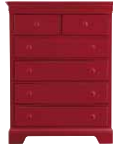
225-0012 ALL SEASONS CHEST 40 1/16W 19 13/16D 52 5/8H (102 x 50 x 134 cm)