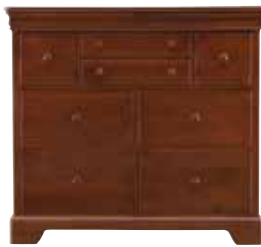
225-0004 ALL SEASONS DRESSING CHEST 52 5/16W 20 11/16D 43 7/8H (133 x 53 x 111 cm)