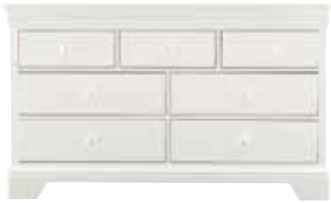
225-0002 ALL SEASONS DOUBLE DRESSER 57 3/8W 20 11/16D 33 7/8H (146 x 53 x 86 cm)