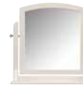
MIR-3125 TILLIE TILT MIRROR Overall: 30 3/8W 5 3/4D 29 1/8H (77 x 15 x 74 cm)