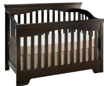
BTG-2500 BUILT TO GROW DEBUT CRIB Overall: 30 11/16W 46H 58L (78 x 117 x 147 cm)