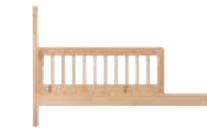
BTK-3230 BUILT TO GROW TODDLER BED KIT