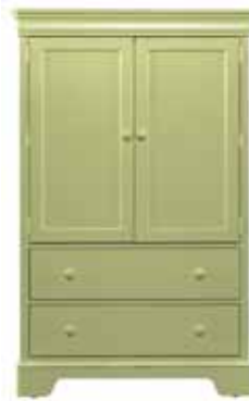
225-0014 ALL SEASONS DOOR CHEST 40 1/16W 20 11/16D 62H (102 x 53 x 157 cm)