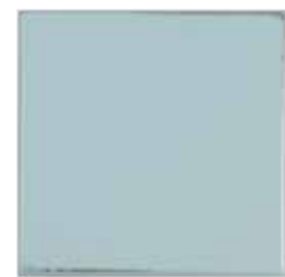
SKY BLUE SAND THRU N2