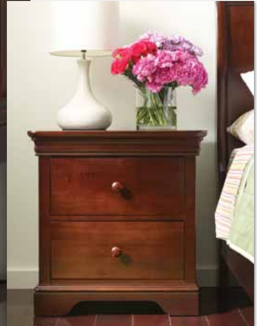
▲ ALL SEASONS 2 DRAWER NIGHT STAND 225-0082-91 MERLOT