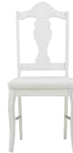
CHR-0072 TAYLOR STUDENT CHAIR 17W 19 1/4D 38 1/4H (43 x 49 x 97 cm)