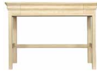
225-0025 ALL SEASONS WRITING DESK 42 9/16W 24 1/16D 30 3/8H (108 x 61 x 77 cm)