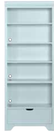
WAL-8285 DANA DRAWER BOOKCASE 30 1/16W 15 11/16D 78H (76 x 40 x 198 cm)