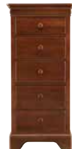
225-0011 ALL SEASONS SINGLE CHEST 22 3/4W 20 11/16D 47 5/8H (58 x 53 x 121 cm)