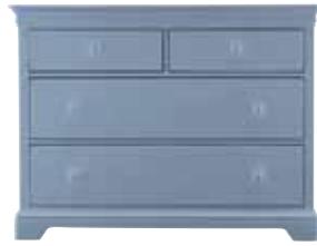
225-0001 ALL SEASONS SINGLE DRESSER 46 15/16W 20 11/16D 33 7/8H (119 x 53 x 86 cm)