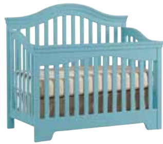
BTG-2000 BUILT TO GROW BRAVO CRIB Overall: 30 11/16W 51 1/2H 58 3/8L (78 x 131 x 147 cm)