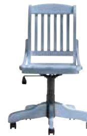
CHR-0071 BAILEY BANKER CHAIR 17W 19 1/4D 38 1/4H (43 x 49 x 97 cm)