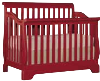
BTG-2400 BUILT TO GROW SLEIGH CRIB Overall: 38W 47 1/2H 55 1/2L (97 x 121 x 141 cm)