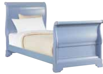
225-5593 ALL SEASONS SLEIGH BED, TWIN Overall: 42 1/4W 49H 87 5/8L (107 x 124 x 223 cm)