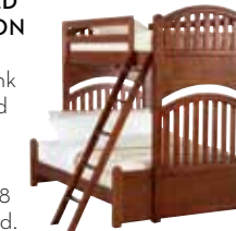
Purchase of SLR-0468 slat roll, full is required.