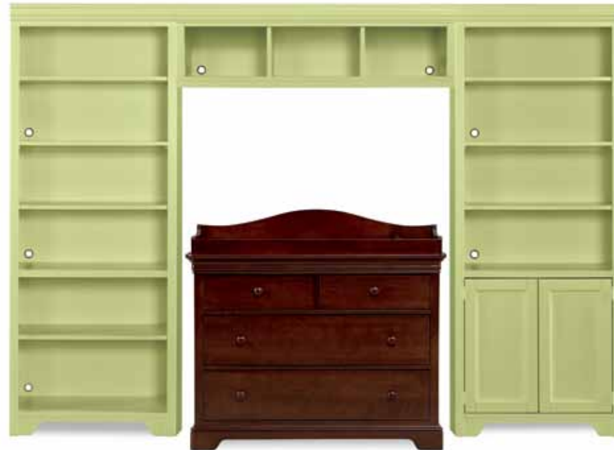
▶ DANA OPEN BOOKCASE WAL-8275-V1 SEA GRASS DANA STORAGE HUTCH WAL-8125-V1 SEA GRASS DANA DOOR BOOKCASE WAL-8295-V1 SEA GRASS CHANGING STATION CHS-3300-91 MERLOT ALL SEASONS SINGLE DRESSER 225-0001-91 MERLOT