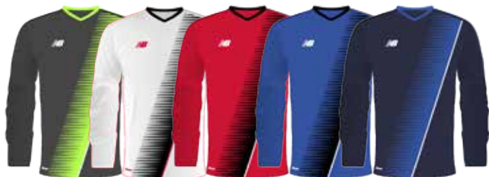
BK Black WT White HRD High Risk Red TRY Team Royal NV Navy