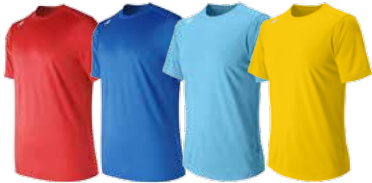
TRE* Team Red TRY* Team Royal CB Columbia Blue ATG Athletic Gold

Featuring a lightweight and comfortable sweat-wicking fabric with a soft feel, our Tech Tee delivers an athletic fit to help give you maximum movement and breathability. Also has an antimicrobial treatment to resist odors so you can wear with confidence. Our Short Sleeve Tech Tee is the perfect all-purpose layer, ready for activity or just cold-chillin'.