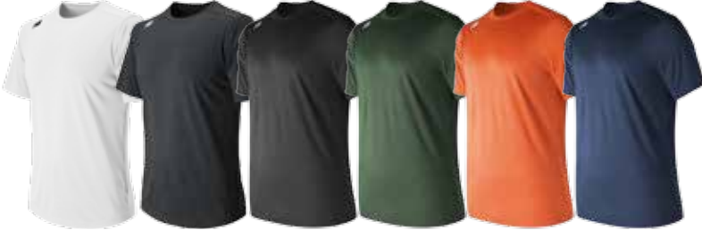
WT* White DH* Dark Heather TBK* Team Black TDG* Team Dark Green TMO* Team Orange TNV* Team Navy