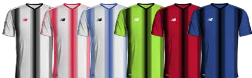
BKW Black/White HRW High Risk Red/ White TRW Team Royal/ White BTX Black/Toxic BHR Black/ High Risk Red BTM Black/ Team Royal