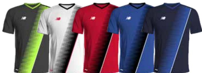
BK Black WT White HRD High Risk Red TRY Team Royal NV Navy