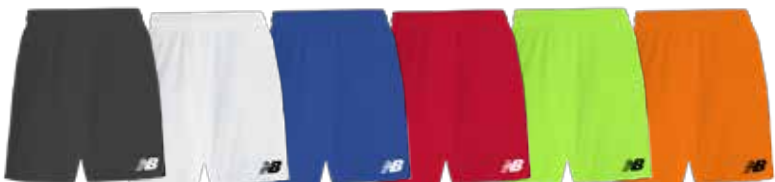
BK Black WT White TRY Team Royal HRD High Risk Red TOX Toxic OGP Orange Popsicle