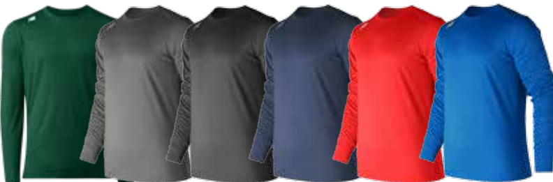
TDG Team Dark Green DH Dark Heather TBK Team Black TNV Team Navy TRE Team Red TRY Team Royal

Featuring a lightweight and comfortable sweat-wicking fabric with a soft feel, our Tech Tee delivers an athletic fit to help give you maximum movement and breathability. Also has an antimicrobial treatment to resist odors so you can wear with confidence. Our Long Sleeve Tech Tee is the perfect all-purpose layer, ready for activity or just cold-chillin'.