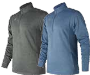
DH Dark Heather