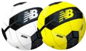
WK White/Black/Silver YLB Yellow/Black