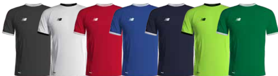
BK Black WT White HRD High Risk Red TRY Team Royal NV Navy TOX Toxic JGN Jolly Green