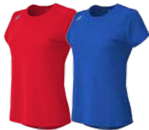
TRE Team Red TRY Team Royal

Featuring a lightweight and comfortable sweat-wicking fabric with a soft feel, our Tech Tee delivers an athletic fit to help give you maximum movement and breathability. Also has an antimicrobial treatment to resist odors so you can wear with confidence. Our Short Sleeve Tech Tee is the perfect all-purpose layer, ready for activity or just cold-chillin'.