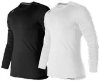
TBK Team Black WT White

With sweat-wicking and odor-resisting technologies, our Long Sleeve Compression Top is cut to move with your body, so getting active has never looked, or felt, better. Also features flatlock seams to help reduce chafing and a droptail hem that helps keep you tucked during practice and game time.