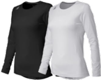
TBK Team Black WT White

With sweat-wicking and odor-resisting technologies, our Long Sleeve Compression Top is cut to move with your body, so getting active has never looked, or felt, better. Also features flatlock seams to help reduce chafing and a droptail hem that helps keep you tucked during practice and game time.