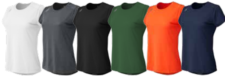
WT White DH Dark Heather TBK Team Black TDG Team Dark Green TMO Team Orange TNV Team Navy