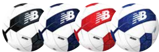
WK White/Black/Silver WN White/Navy/Silver SCW White/Scarlet/Silver WR White/Royal/Silver