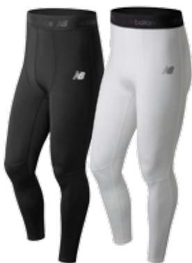
TBK Team Black