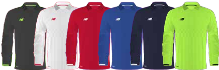
BK Black WT White HRD High Risk Red TRY Team Royal NV Navy TOX Toxic