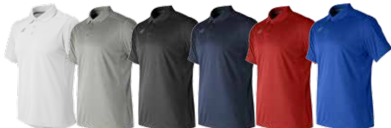
WT White LG Light Grey TBK Team Black TNV Team Navy TRE Team Red TRY Team Royal

The men's Performance Tech Polo is the perfect shirt for warm-weather activities. Flatback mesh inserts allow for air circulation to help keep you cool while outdoors. Plus, details like the ribbed collar, textured pindot fabric and the slight droptail hem bring a tailored touch to this essential.