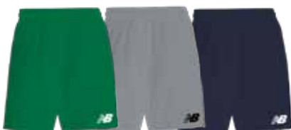
JGN Jolly Green ALY Alloy NV Navy