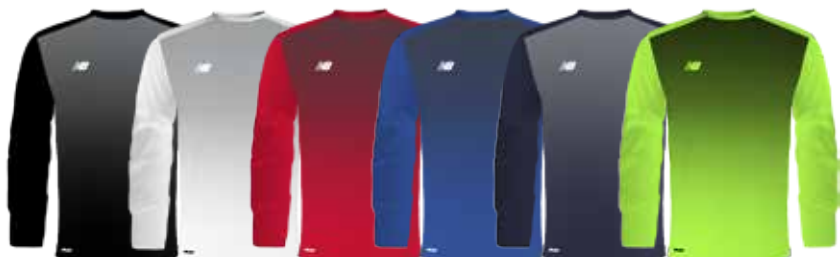
BK Black WT White HRD High Risk Red TRY Team Royal NV Navy TOX Toxic