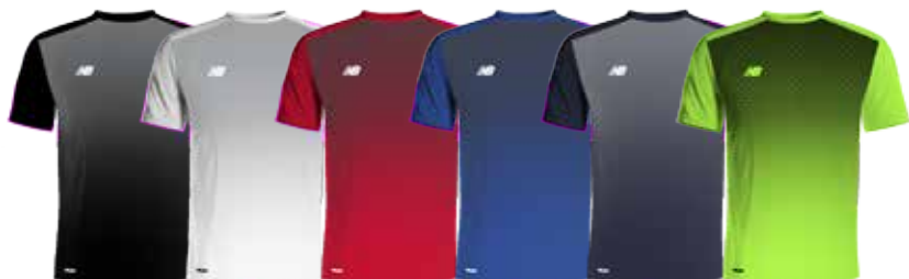
BK Black WT White HRD High Risk Red TRY Team Royal NV Navy TOX Toxic