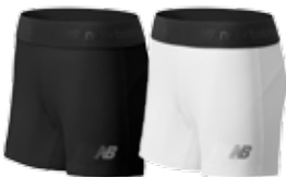
TBK Team Black WT White

Our Women's Compression Short is made with sweat-wicking and odor-resisting technologies so you can work out, practice and perform with confidence. Short is cut to fit your body with comfort and ease of movement in mind. Plus, flatlock seams help reduce chafing making this the essential base layer for every activity.