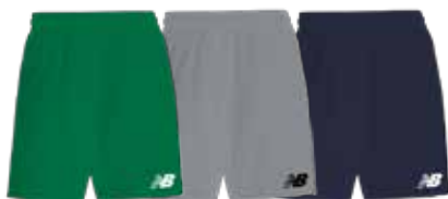
JGN Jolly Green ALY Alloy NV Navy