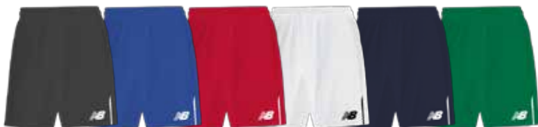
BK Black TRY Team Royal HRD High Risk Red WT White NV Navy JGN Jolly Green