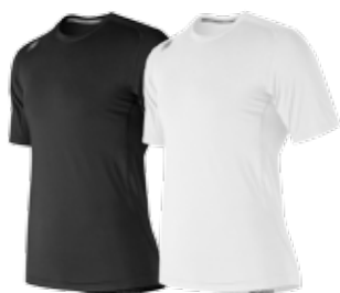
TBK Team Black