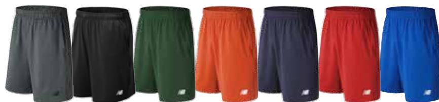
DH* Dark Heather