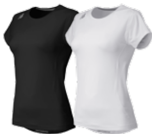
TBK WT Team Black White

With sweat-wicking and odor-resisting technologies, our Short Sleeve Compression Top is cut to move with your body, so getting active has never looked, or felt, better. Also features flatlock seams to help reduce chafing and a droptail hem that helps keep you tucked during practice and game time.