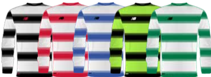
BKW Black/White HRW High Risk Red/ White TRW Team Royal/ White BTX Black/Toxic WG White/Green