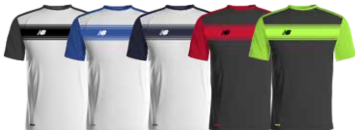
WK White/Black WRO White/ Team Royal WN White/Navy BHR Black/ High Risk Red BTX Black/Toxic