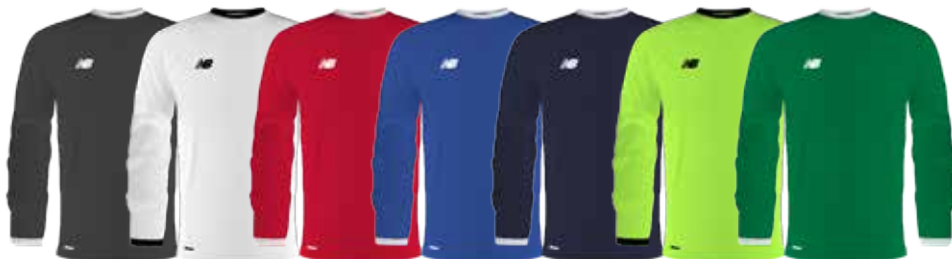
BK Black WT White HRD High Risk Red TRY Team Royal NV Navy TOX Toxic JGN Jolly Green