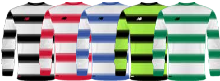
BKW Black/White HRW High Risk Red/ White TRW Team Royal/ White BTX Black/Toxic WG White/Green