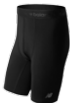
TBK Team Black

Our Men's Compression Short is made with sweat-wicking and odor-resisting technologies so you can work out, practice and perform with confidence. Short is cut to fit your body with comfort and ease of movement in mind. Plus, flatlock seams help reduce chafing making this the essential base layer for every activity.