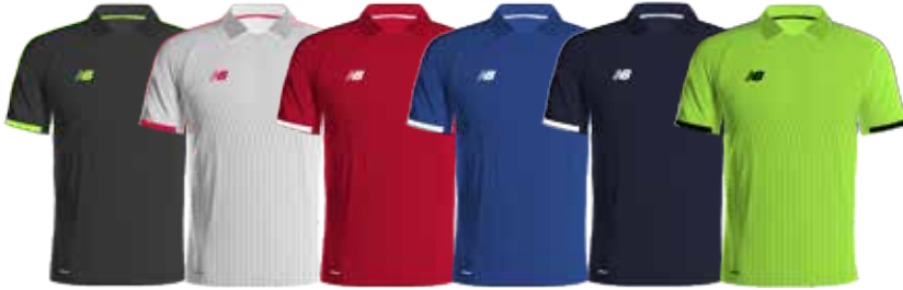
BK Black WT White HRD High Risk Red TRY Team Royal NV Navy TOX Toxic