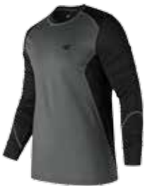
TBK Team Black

Beat the cold while you beat your opponent. For practice or game time, ward off the early season chill with the moisture-wicking Long Sleeve Cold Crew, the perfect heat-holding base layer to fit smoothly under your jersey. Never let cold keep you from bringing the heat.