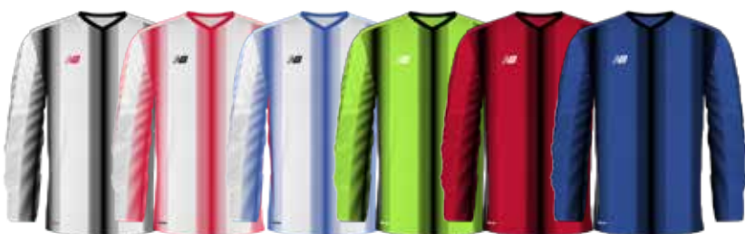
BKW Black/White HRW High Risk Red/ White TRW Team Royal/ White BTX Black/Toxic BHR Black/ High Risk Red BTM Black/ Team Royal