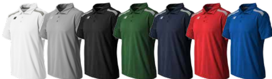
WT White LG Light Grey TBK Team Black TDG Team Dark Green TNV Team Navy TRE Team Red TRY Team Royal

An update to the classic coach's polo, this athletic fit NB Polo is built for performance with a fast wicking poly/mesh body, antimicrobial treatment to resist odors and contrast inserts at shoulders. The self-fabric collar construction keeps you looking well-kempt and in style.