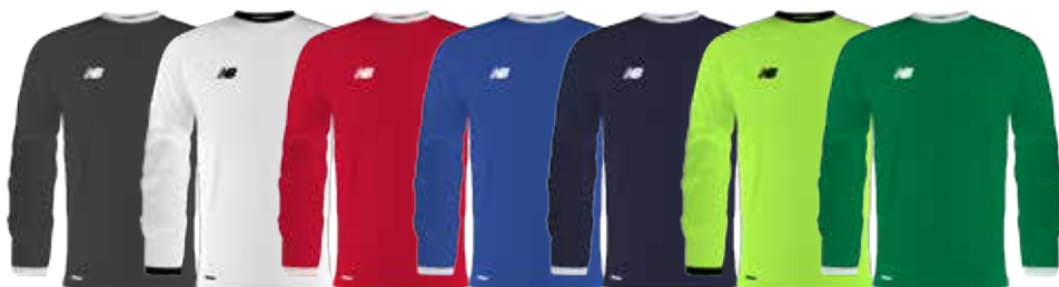
BK Black WT White HRD High Risk Red TRY Team Royal NV Navy TOX Toxic JGN Jolly Green