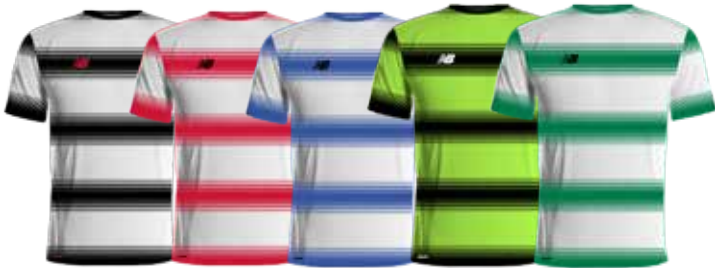
BKW Black/White HRW High Risk Red/ White TRW Team Royal/ White BTX Black/Toxic WG White/Green