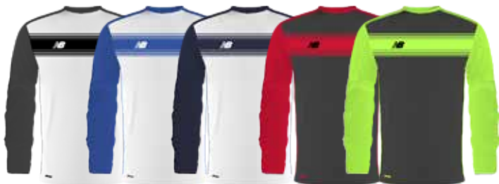
WK White/Black WRO White/ Team Royal WN White/Navy BHR Black/ High Risk Red BTX Black/Toxic