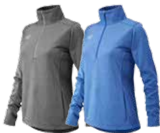
DH Dark Heather