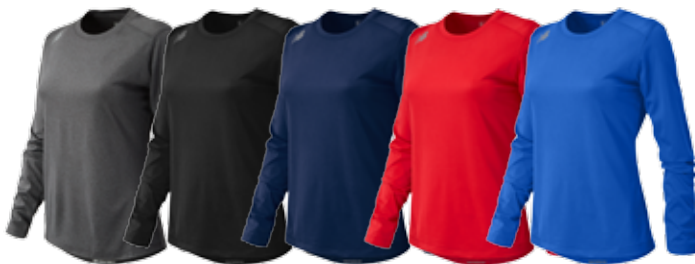
DH Dark Heather TBK Team Black TNV Team Navy TRE Team Red TRY Team Royal

Featuring a lightweight and comfortable sweat-wicking fabric with a soft feel, our Tech Tee delivers an athletic fit to help give you maximum movement and breathability. Also has an antimicrobial treatment to resist odors so you can wear with confidence. Our Long Sleeve Tech Tee is the perfect all-purpose layer, ready for activity or just cold-chillin'.