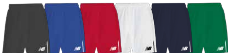
BK Black TRY Team Royal HRD High Risk Red WT White NV Navy JGN Jolly Green