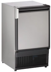
STAINLESS SOLID (NO FLANGE)