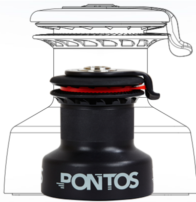
SIZE 28, POWER OF A 45

The Compact winch offers both extra power and speed because of its improved two-gear mechanism. First gear on the Compact sheets in line twice as fast as a conventional two-speed winch; reversing the direction on the winch handle drops it into second gear, which delivers the