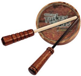
Turkey Slate Call 75-3389

Calls are designed to mimic the sound of the game/species being hunted. Some calls will mimic a wounded animal that predators hunt. Here are some examples of calls that can be used for turkey, geese, moose and deer.