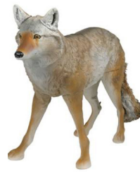
Coyote Decoy 75-1386