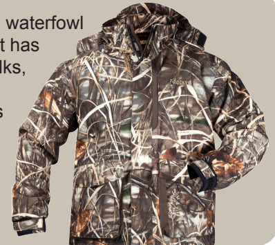
Rocky Waterfowl 175-0729

This is an example of a waterfowl camouflage pattern that has cattails, mullet, cornstalks, etc., and provides maximum effectiveness for waterfowl in any open terrain.