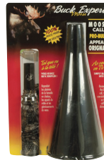
Moose Call 75-0144