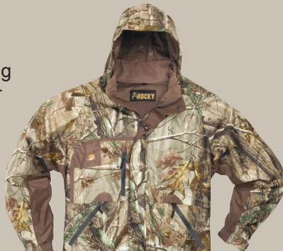
Rocky Synergy Real Tree All Purpose 75-3626

This is an example of a waterfowl camouflage pattern that has cattails, mullet, cornstalks, etc., and provides maximum effectiveness for waterfowl in any open terrain.