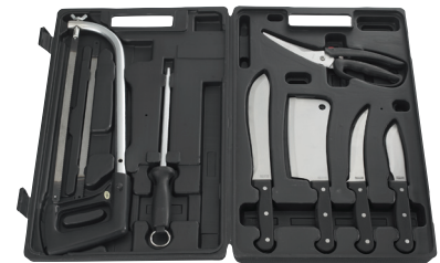
Game Processing Kit 75-5572