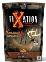
Fixation Grain Bait 75-3316

Food attractants may be in the form of a mineral salt lick or seed that can be spread out to attract game such as deer to the location where the hunter plans to hunt. They are made with the food the animal prefers to feed on. The grain attractants can be placed in a feeding station which they will feed from. Check with your local regulations for usage restrictions.