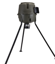
Grain Feeder 175-1038