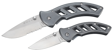
Knife Combo Set 75-5609

Gloves: Protect the hunter's hands against diseases (e.g., Ticks) when field dressing game animals.