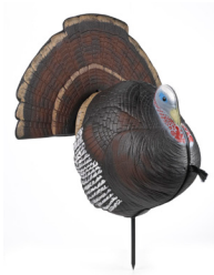
Jake Decoy 75-4639