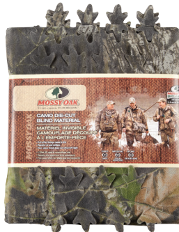
Blind Camo Tarp 75-0768

Designed for geese and duck hunting which the hunter can lie in and then open the top portion to take a shot.