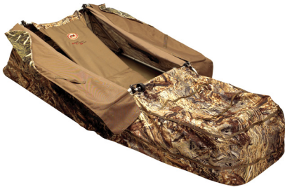
Pack 'n Go Blind 175-0541

A blind is a covered area which is used to remain hidden from prey while lying in wait. There are several types of blinds available depending on what you are hunting.