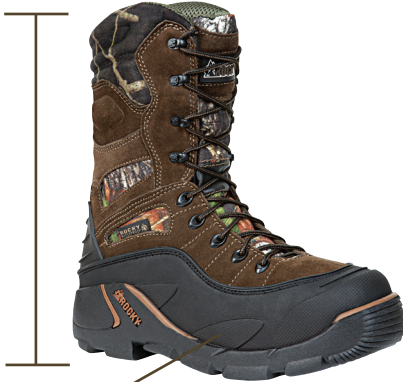
Rocky Insulated Boot 87-3481

Hunting boots come in a range of heights from ankle high to almost knee high. Taller boots provide more support, but they also weigh more and generally cost more. For example, hunters walking in rough terrain, where steep climbs or descents are expected, should wear boots at least 8 inches high.