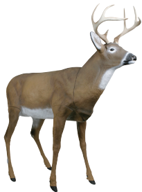
Full Body Deer Decoy 75-5575

A decoy is a wooden or plastic object that resembles the game or bird being hunted. Decoys are used when hunting waterfowl, turkey, predators (coyotes) and deer.