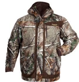
Rocky Scent IQ Parka 75-3576

Materials such as fleece or micro-suede tend to be quieter which is ideal for hunters when brushing up against trees or bushes.