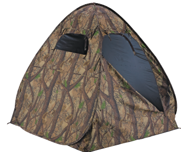
Ground Blind 75-4190

Blind tarps can be used to provide additional cover when building a blind from cornstalks or other materials for hunting different types of game.