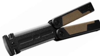
Knife Sharpener 175-0788