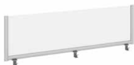
72W Desktop Privacy Screen PSP172FR List Price – $712.00 69.09"W x 17.72"H