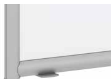
Top Mount Hardware (Set of 3) PSP2025V List Price – $50.00