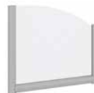
24W Side Desktop Privacy Screen PSP124FR List Price – $397.00 21.42"W x 17.72"H