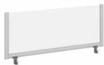
48W Desktop Privacy Screen PSP148FR List Price – $506.00 45.67"W x 17.72"H