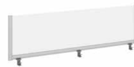
66W Desktop Privacy Screen PSP166FR List Price – $700.00 64.96"W x 17.72"H