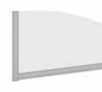
30W Side Desktop Privacy Screen PSP-130FR List Price – $430.00 28.82"W x 17.72"H