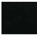
Black Powder Coat