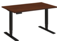
48W x 30D Height Adjustable Standing Desk* 47.60"W x 29.37"D x 51.00"H Cool Gray Metallic HAT4830XXK List Price - $1,499.00 Black Powder Coat (shown above) HAT4830XXBK List Price - $1,499.00