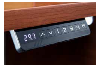
Shown in Storm Gray with Office 500

Store your favorite heights for repeated use with 4 programmable presets.