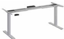
24D Straight Height Adjustable Standing Desk Base* 70.98"W x 22.64"D x 50.00"H Cool Gray Metallic (shown above) HATB24DGM-03K List Price - $1,317.00 Black Powder Coat HATB24DBL-03K List Price - $1,317.00