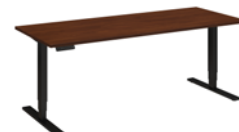
72W x 30D Height Adjustable Standing Desk* 71.02"W x 29.37"D x 51.00"H Cool Gray Metallic HAT7230XXK List Price - $1,568.00 Black Powder Coat (shown above) HAT7230XXBK List Price - $1,568.00