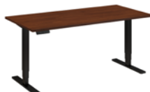
60W x 30D Height Adjustable Standing Desk* 59.45"W x 29.37"D x 51.00"H Cool Gray Metallic HAT6030XXK List Price - $1,549.00 Black Powder Coat (shown above) HAT6030XXBK List Price - $1,549.00