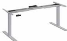
30D Straight Height Adjustable Standing Desk Base* 70.98"W x 22.64"D x 50.00"H Cool Gray Metallic (shown above) HATB30DGM-03K List Price - $1,317.00 Black Powder Coat HATB30DBL-03K List Price - $1,317.00